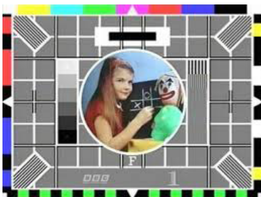
The BBC Test Pattern from the introduction of colour television

That brings us to the end of another instalment until next time take care.