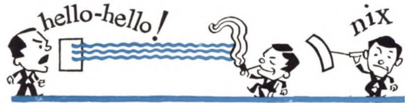
INTERRUPTING SMOKE SCREEN

Efforts were next devoted to study of different colored beams of light and their respective penetrating qualities. It was soon discovered that the seven distinguishable colors seen by the human eye behave differently. Red, yellow, orange, green, blue, indigo and violet were all used as the light beam for transmitting the voice flickering. Violet was easily absorbed—blue was a little better, and so on down until red was found to be the best of all. The flickering red beam actually penetrated thin smoke and haze, while the violet beam was completely absorbed.