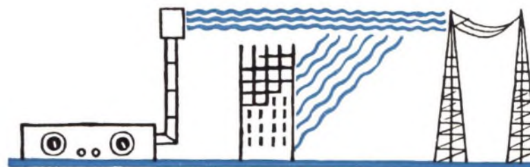
INTERCEPTING SOUND WAVES

thousands of colors above the visible octave and below the visible octave—that probably there were colors still further down the scale below the heat beams that would exhibit even greater penetrating power. Professor Maxwell proved mathematically that these colors did exist. Professor Bell acclaimed them analytically. It remained for Professor Hertz in 1887 to actually discover them.