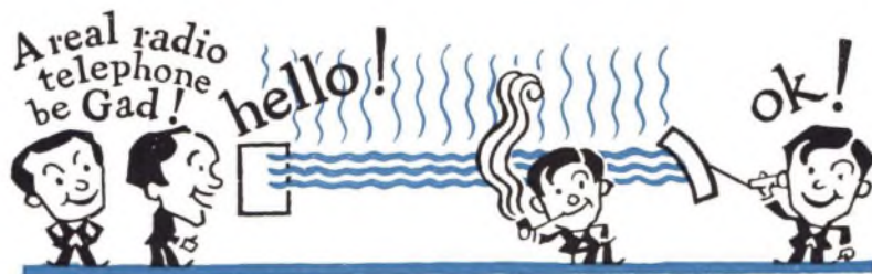
THE INVISIBLE VIOLET RAY

The knowledge gained by the study of the heat beams led to further speculation on the laws of so-called transparency. It was argued that undoubtedly the range of colors were infinite—that there were probably thousands upon