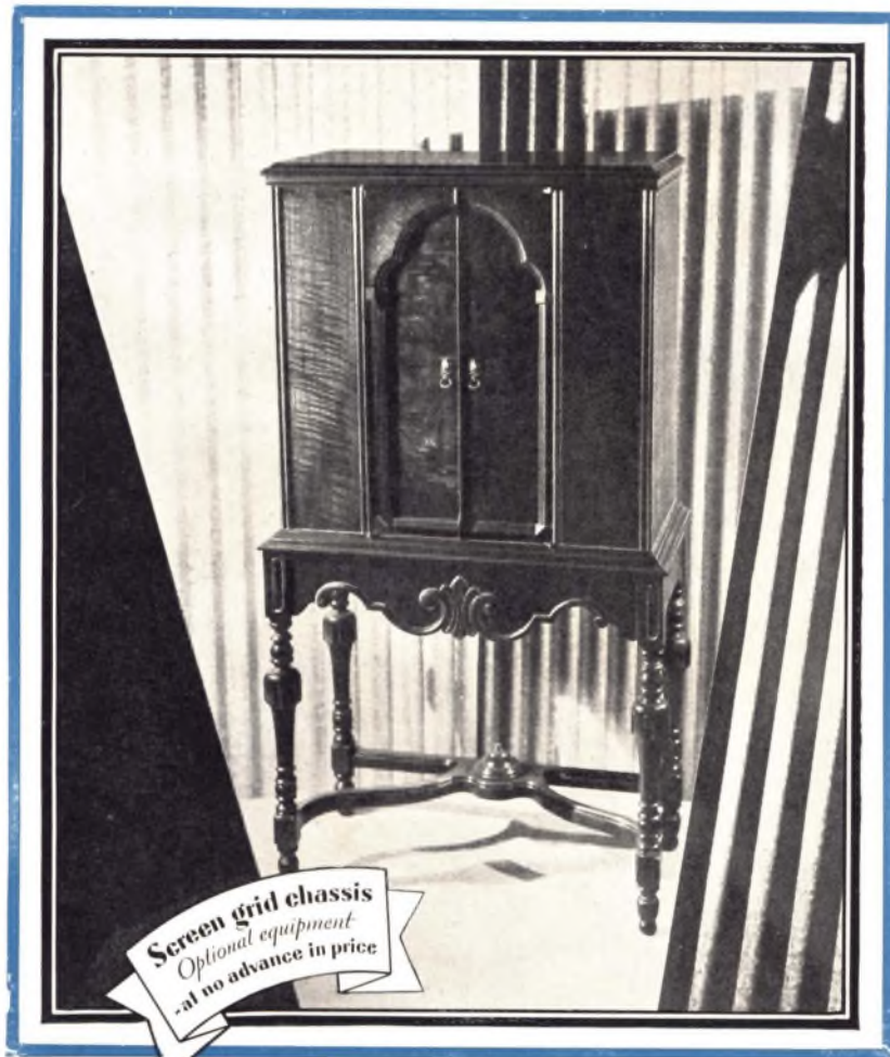
THE HIGHBOY The Temple Grand Console

Temple is more than a name. It signifies a tone perfect in purity of reproduction—an acoustic realism established after years of successful manufacturing.