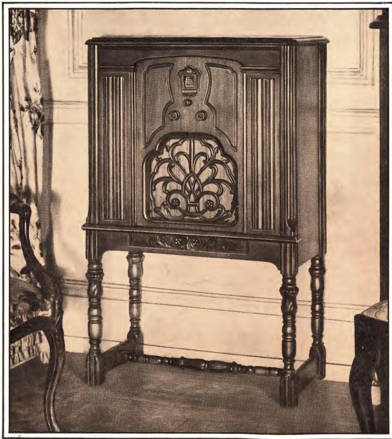
MODEL WR-5 is a lowboy, open-faced:—cabinet of Early English Elizabethan design in walnut, satin finish. Screen-grid super-heterodyne. Size: 43" high, 27½" wide, 14" deep.