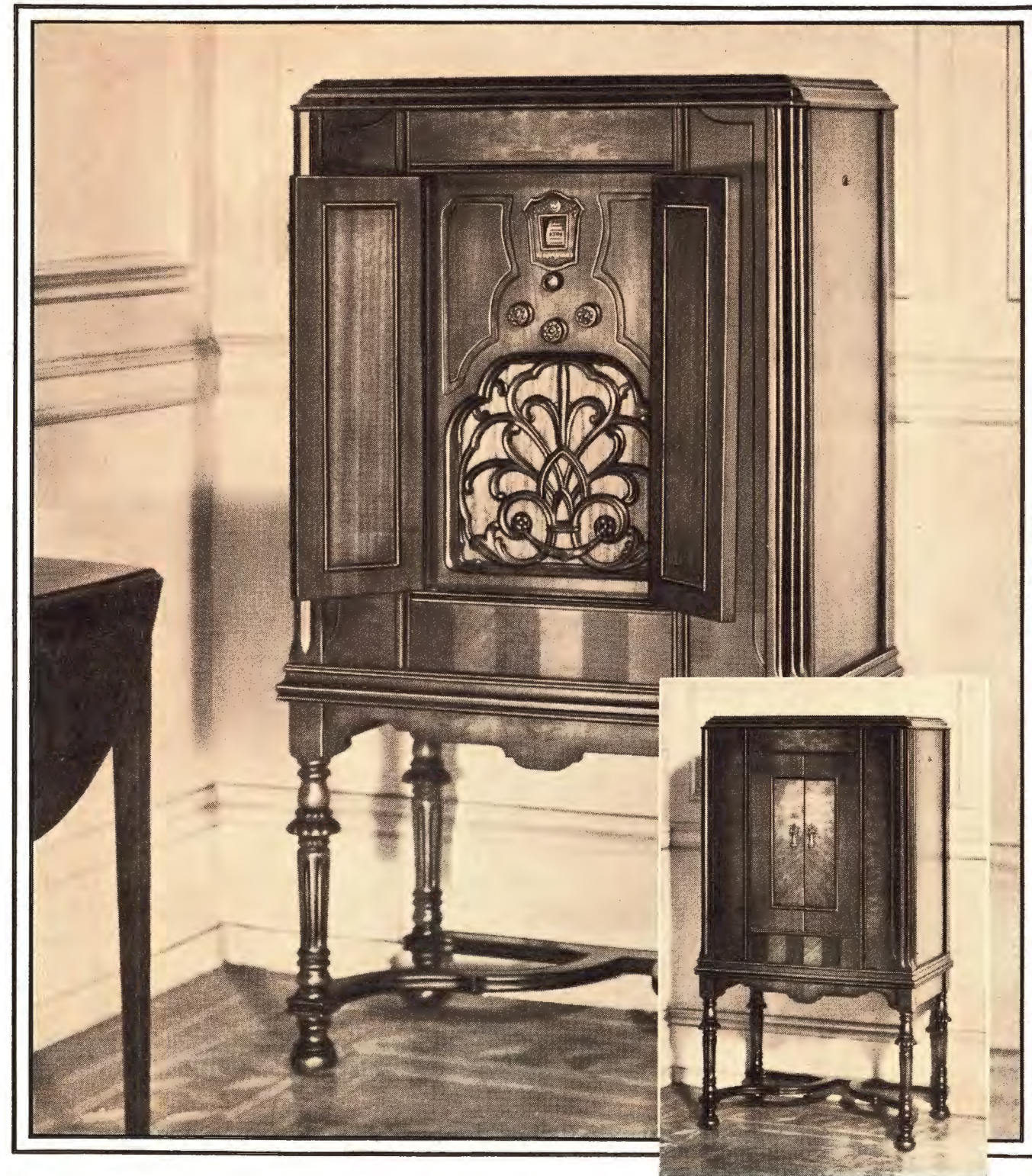
MODEL WR-6 is a screen-grid super-heterodyne with special tone control. The cabinet is Early American design in butt walnut and heartwood; walnut, satin finish. Will also be available with remote control. Size: 48" high, 27⅝" wide, 17" deep.