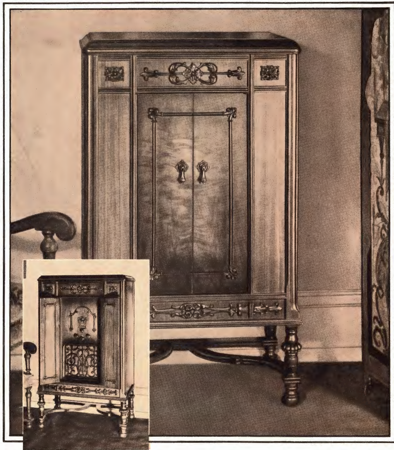
MODEL WR-7 is a combination phonograph-radio, with a special tone-control. Screen-grid super-heterodyne circuit. Cabinet . . . Early American design in butt walnut and heartwood, with walnut finish overlays; walnut, satin finish. Will also be available with remote control. Size: 45" high, 27½" wide, 18" deep.