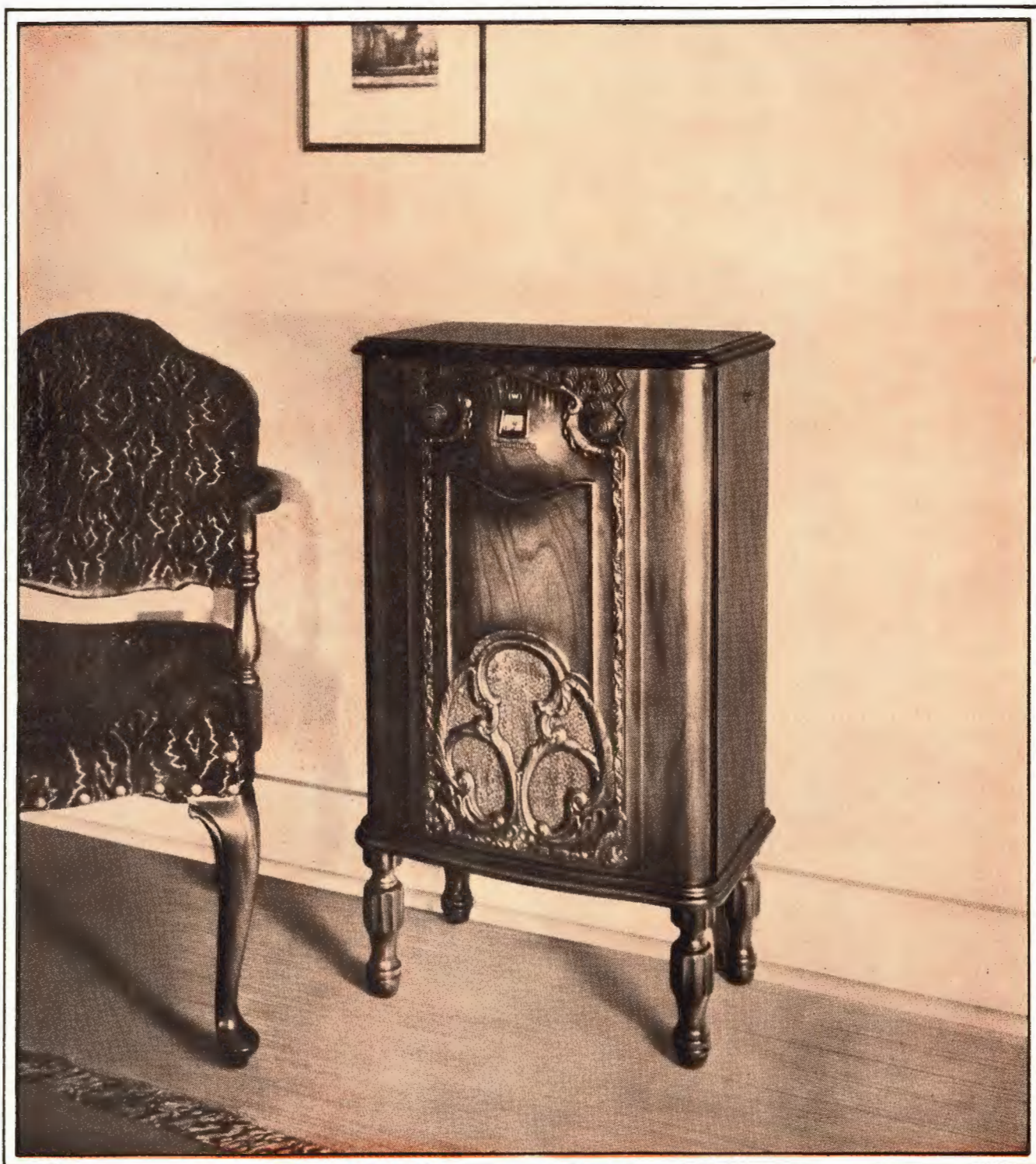
MODEL WR-4 is a lowboy, open faced:—cabinet of Italian Renaissance design, with facsimile hand carving in walnut, satin finish. Screen-grid—tuned radio frequency. Size: 34 \frac{3}{4} " high, 20 \frac{1}{2} " wide, 12 \frac{7}{8} " deep.