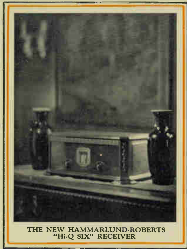
THE NEW HAMMARLUND-ROBERTS "Hi-Q SIX" RECEIVER

HAMMARLUND-ROBERTS, Inc. 1182 BROADWAY NEW YORK CITY