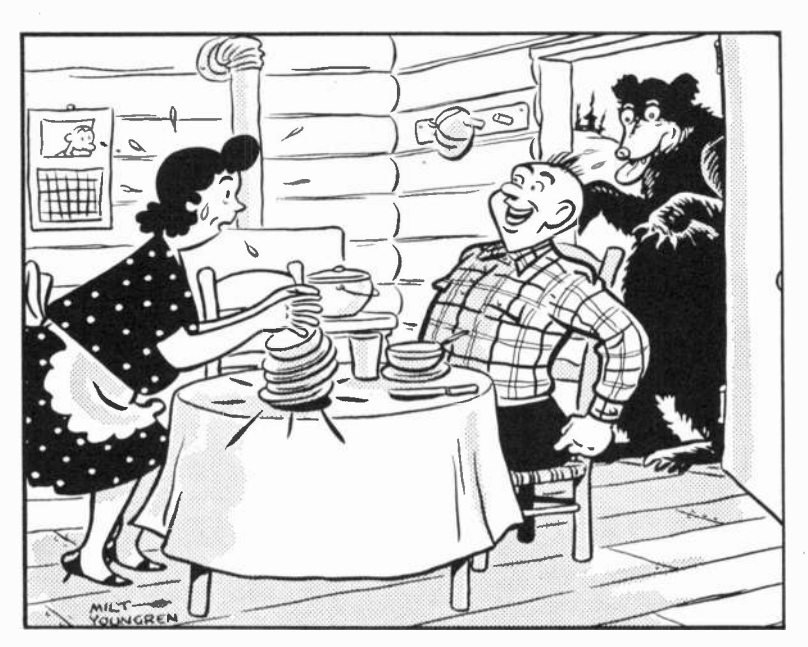
"You Know, Dear, After That Big Bowl of Quaker Oats I Feel Like Wrestlin' with a Bear!"

Of course, Quaker Oats can't quite guarantee you an even chance with a grizzly! But if you have the more usual problems of keeping up energy and fighting fatigue in a busy life—try energy-boosting breakfasts of delicious hot Quaker Oats! Whole-grain oatmeal is richer than other natural cereals in Vitamin B<sub>1</sub>, the anti-fatigue "energy" vitamin—in energizing Food-Iron—in Food-Energy itself! And in Protein,