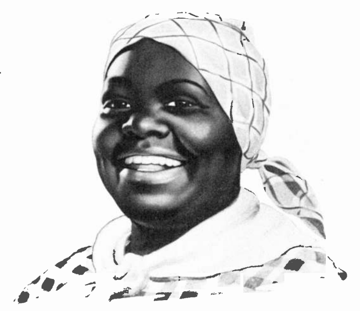
THE LEGEND OF AUNT JEMIMA

Gracious living was the keynote of life at Higbee's Landing where, legend has it, the original Aunt Jemima was a mammy cook.