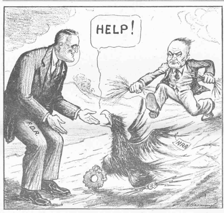
The Black And Blue Eagle