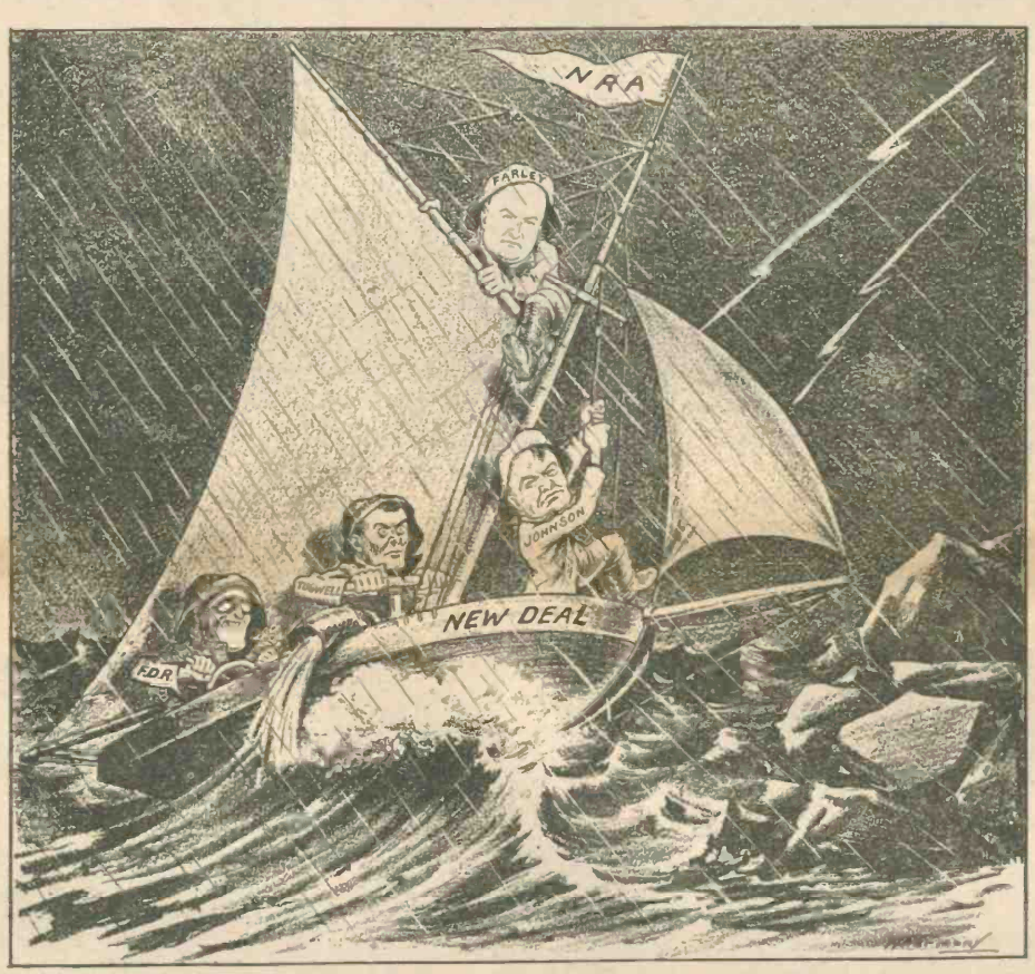
Can They Keep Her Off The Rocks?