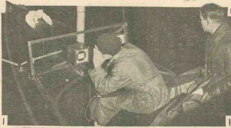
THE BRITISH BROADCASTING Corporation sets up its paraphernalia to broadcast an evening sporting event on the London river.

the printed word should crush the spoken word before it gets too strong. There was a time when, if the "wild men" of the newspaper industry had had their way, the consequences to broadcasting might have been damaging.