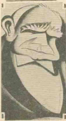
WALTER DAMROSCH, veteran conductor, is caricatured by XAMIER CUGAT, formerly conductor of the Waldorf-Astoria Orchestra. DAMROSCH again will preside over his NBC Music Appreciation Hours in the Fall.