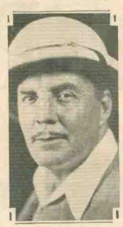
FRANK BUCK, wild animal hunter of "Bring 'Em Back Alive" fame, is replacing Amos 'n' Andy on the NBC-WJZ network every evening except Saturdays and Sundays at 7.45.

"White Terror," drama, WJZ KDKA WSM, 30 m.