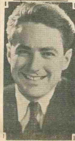
DON VOORHEES, radio and stage orchestra leader, who will be the general music director for "The GIBSON Family."

radio maestro, will be the general musical director for the show. CONRAD THIBAUT will have the leading male role. Opposite him will be LOIS BENNETT, radio soprano, who was heard for a time on Captain HENRY'S Showboat as MARY LOU.