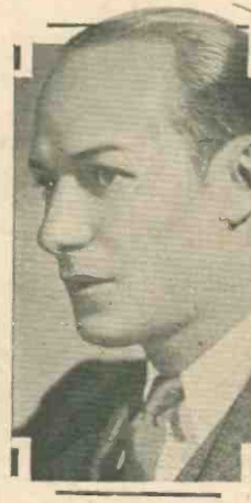
TED HUSING, CBS announcer, recently divorced, who soon will marry JEAN HARLOW, movie actress, according to rumors.