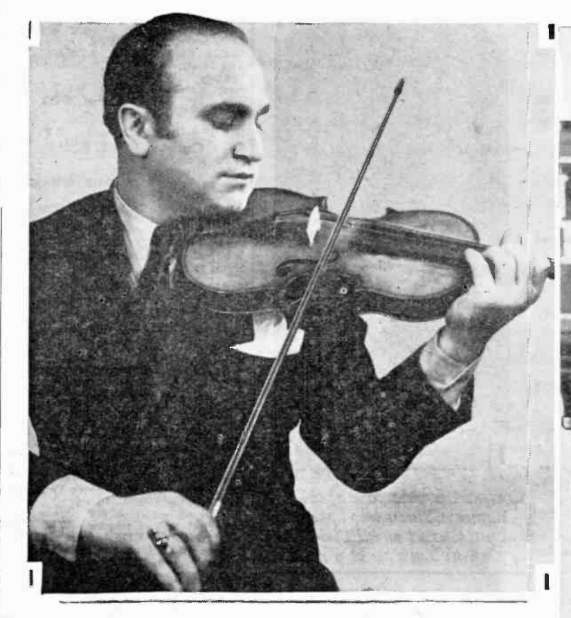
RUBINOFF, whose first name remains cloaked in mystery, staunchly suffers jibes from the CANTOR tongue each Sunday.

speakers, the tempo of the program. There's no such thing as lounging back in an easy chair when this pro-