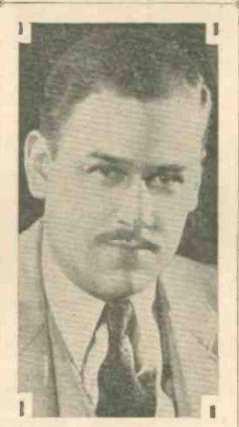
dance orchestra leader. now heard on the radio,

on the NBC-WEAF network. The series, titled "The United States and World Affairs" and the Changing World" on December