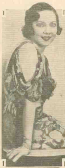
RITA BELL, vocalist, is heard several times weekly as soloist with dance orchestras over both the NBC and CBS networks.