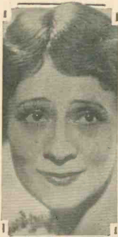
IRENE RICH of screen fame stars in a program broadcast over the NBC-WJZ network Fridays at 8 P.M.