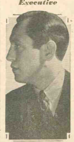
WILLIAM S. PALEY is the accomplished president of the Columbia Broadcasting System.