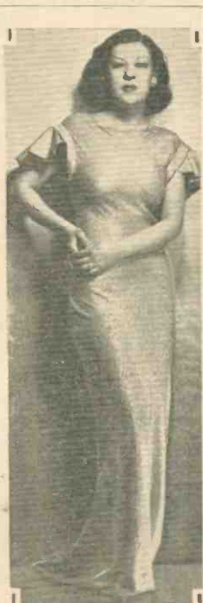
GERTRUDE NIESEN, exotic singing star of "The Big Show," on the Columbia network, heard at 9:30 P. M. on Mondays.

according to the "act" she had planned to put on for the benefit of the producer. She applied lipstick generously, pencilled her eyebrows, mascaraed her eyelashes, dabbed perfume, pulled her hat down over one eye, borrowed her mother's furs, and practiced a gliding walk that would make anybody look twice.