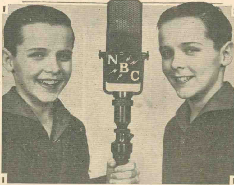
BILLY and BOBBY MAUCH smile, perhaps in anticipation of their Thanksgiving dinner, which is not far off. At the left is BILLY—or is it BOBBY? The two are known as the NBC Twins and are heard on half a dozen programs. They are exactly the same height, vary only a half pound in weight and have dark hair and hazel eyes. Before coming to radio they made a reputation on the stage as the Singing and Dancing Twins. Now they sing and play in dramas over the NBC networks.