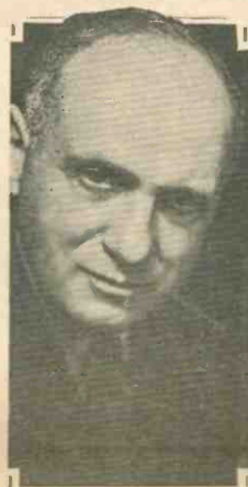
SAMUEL L. ROTHAFEL, better known as "ROXY."

They also retain something of the flavor of programs of earlier days, for ROXY is a thorough believer in spontaneity, informality and the freshness of spirit which character-