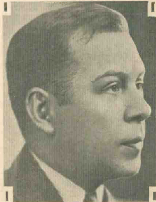
WILFRED PELLETIER, Metropolitan Opera conductor, who directs the orchestra for the LAWRENCE TIBBETT programs, broadcast over the NBC-WJZ network Tuesdays at 8.30 P. M.