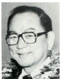
Senator Spark Matsunaga (D-Hawaii)