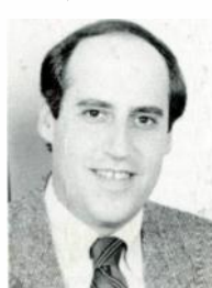
Representative Dan Glickman (D-Kansas — 4th District)