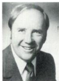
Representative Carlos Moorhead (R-California — 22nd District)