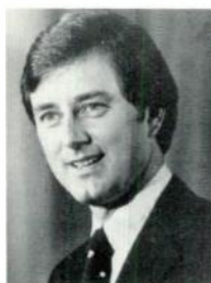
Senator Larry Pressler (R-South Dakota)