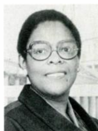
Representative Cardiss Collins (D-Illinois — 7th District)