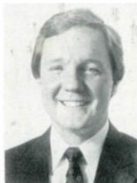
Representative John Bryant (D-Texas — 5th District)