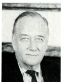
Senator Charles McC Mathias (R-Maryland)