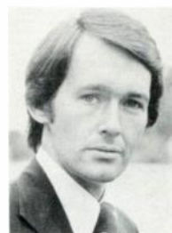
Representative Edward Markey (D-Massachusetts — 7th District)