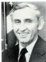
Representative Romano Mazzoli (D-Kentucky — 3rd District)