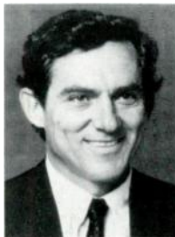
Representative Wayne Dowdy (D-Mississippi — 4th District)