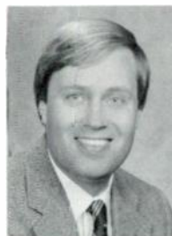
Representative Michael Oxley (R-Ohio — 4th District)