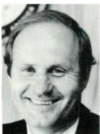
Representative Jim Bates (D-California — 44th District)