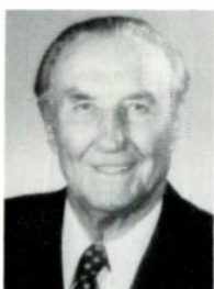
Senator Strom Thurmond (R-South Carolina)