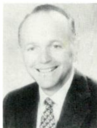
Senator Dennis DeConcini (D-Arizona)