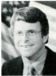
Representative Michael DeWine (R-Ohio — 7th District)