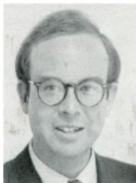
Representative Frederick Boucher (D-Virginia — 9th District)