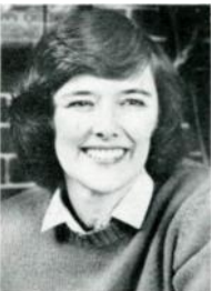
Representative Patricia Schroeder (D-Colorado — 1st District)