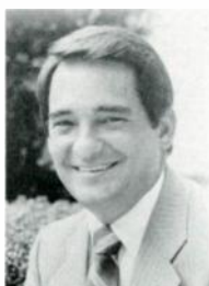
Representative Billy Tauzin (D-Louisiana — 3rd District)