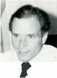
Representative Don Ritter (R-Pennsylvania — 15th District)