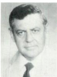
Senator Edward Zorinsky (D-Nebraska)