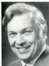
Representative Robert Kastenmeier (D-Wisconsin — 2nd District)