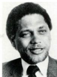
Representative Mickey Leland (D-Texas — 18th District)