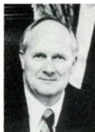
Representative Howard Nielson (R-Utah — 3rd District)