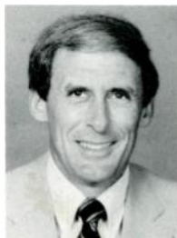
Representative Dan Coats (R-Indiana — 4th District)