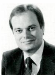
Representative Thomas Tauke (R-Iowa — 2nd District)