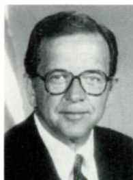
Senator Ted Stevens (R-Alaska)