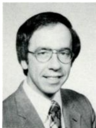
The Honorable Mark S. Fowler FCC