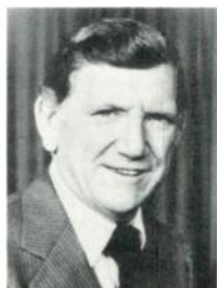
Senator J. James Exon (D-Nebraska)