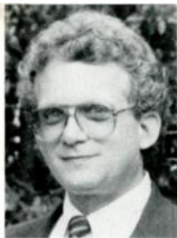
Representative Howard Berman (D-California — 44th District)