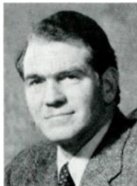
Representative Hamilton Fish (R- New York — 21st District)