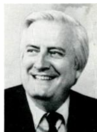
Representative Henry Hyde (R-Illinois — 6th District)