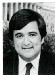
Representative Bill Richardson (D-New Mexico — 3rd District)