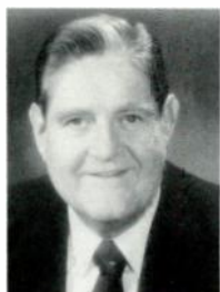
Senator Howell Heflin (D-Alabama)