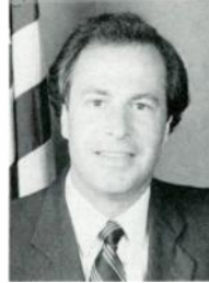
Representative Gerry Sikorski (D-Minnesota — 6th District)