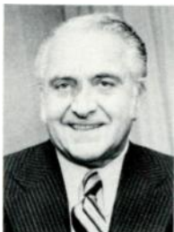
The Honorable James Quello FCC