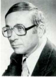
Representative Matthew Rinaldo (R-New Jersey — 7th District)