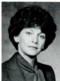
The Honorable Mimi Weyforth Dawson FCC