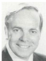
Representative Norman Lent (R-New York 4th District)