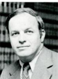
Representative Richard Shelby (D-Alabama — 7th District)