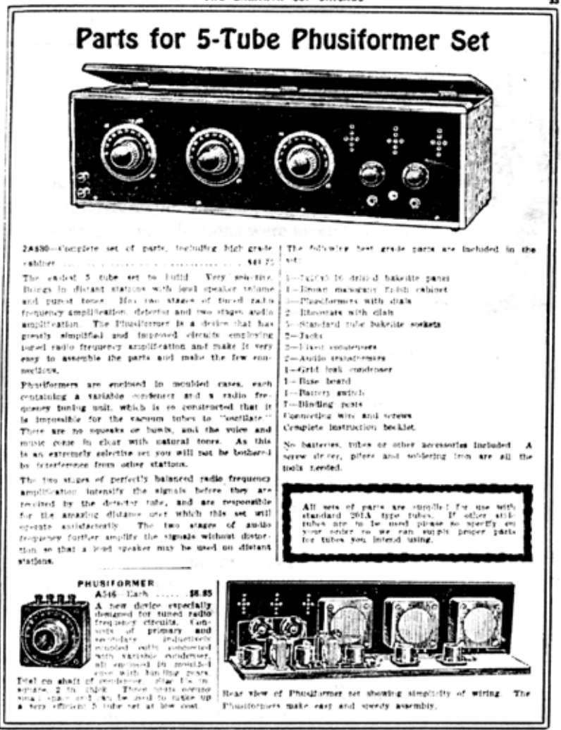
Prices on This Page Are Pressid East of the Rocky Mountains