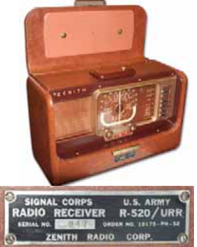
Military TransOceanic - Del Dixon