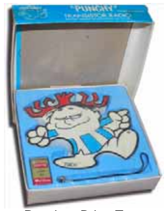
Punchy - Brian Toon