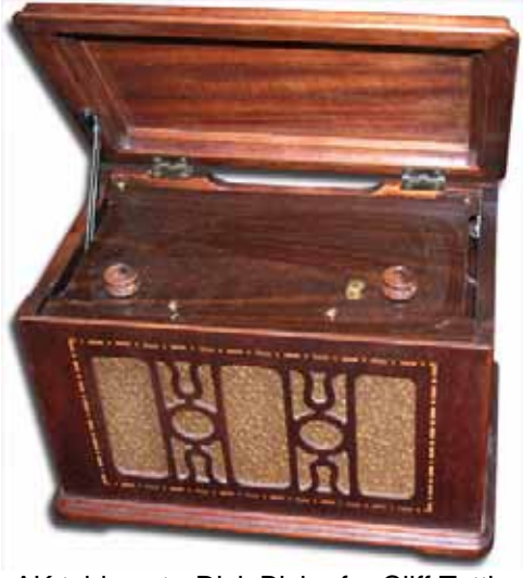
AK table set - Dick Bixler for Cliff Tuttle