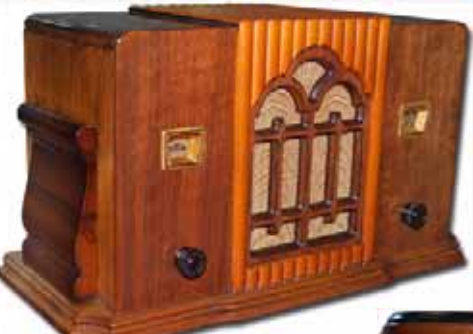
Gilfillan - Sonny Clutter