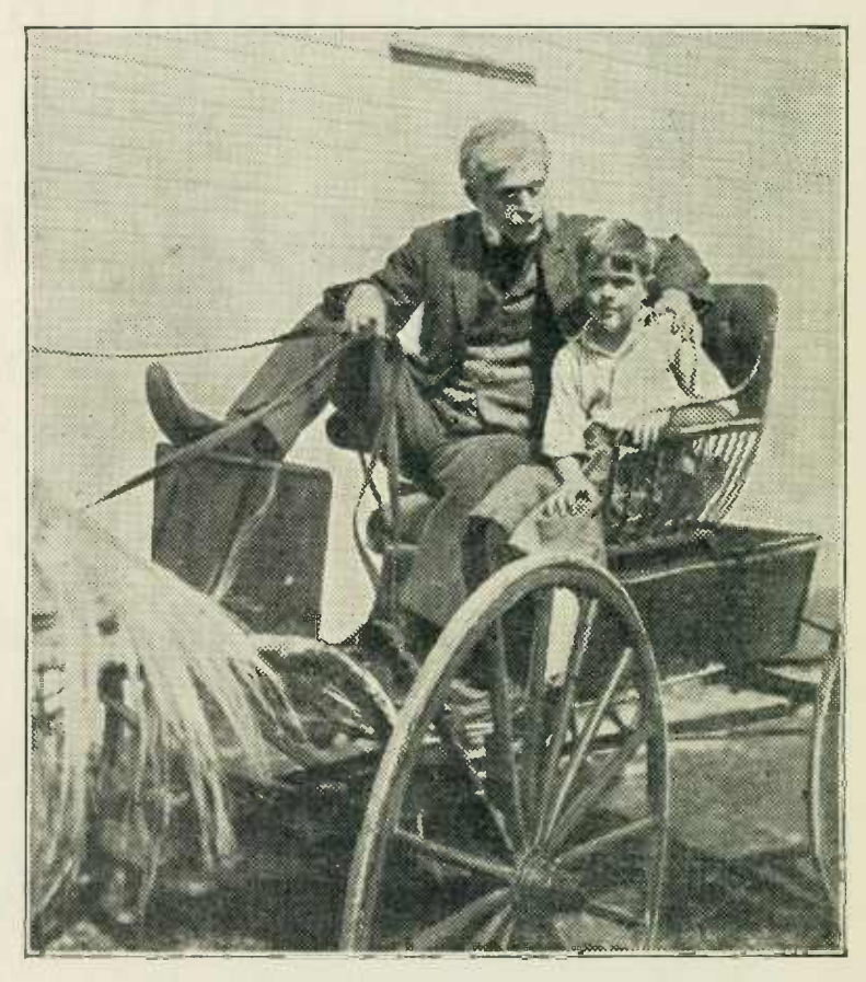
The Country Doctor in His Old-Time Vehicle.