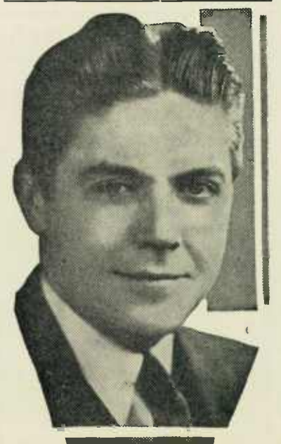
FEATURED soloist on the new