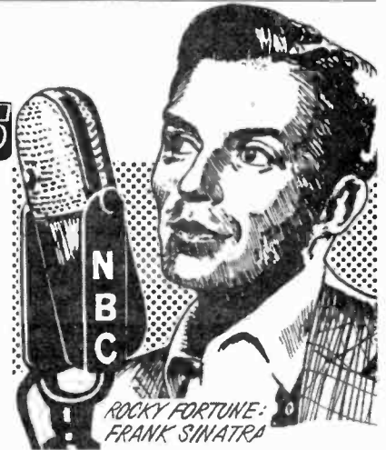
ROCKY FORTUNE: FRANK SINATRA