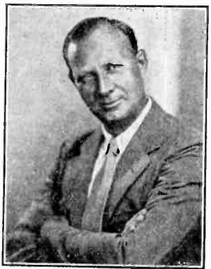
"Singin' Sam, The Barbasol Man," one-man minstrel show. (CBS on Mondays, Wednesdays and Fridays at 8:15 EST.)

High voltage for the receiver and the transmitter is obtained from separate dynamotors operating from the battery. The receiver dynamotor runs continuously. The transmitter dynamotor is started only when about to transmit.