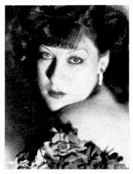
Gertrude Niesen, exotic young singer and impersonator. On the CBS Saturday at 10:45 p. m. and with Columbia Revue Monday and Friday at 10 p. m. EST.

Radio receivers made for operation on 110-volt electric lines are equipped with filter devices. But these are particularly for the purpose of smoothing hum and ripple from the rectified current within the set so as to make the set humless. But such filters are