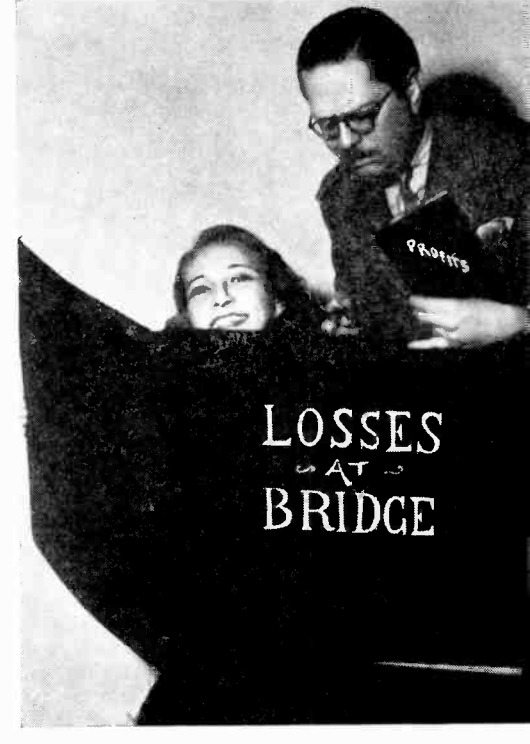
The profit and loss account of the "Easy Aces" is something terrible. Jane thinks Ace is "downright abdominal" about it. CBS Tuesday, Thursday and Saturday at 8:00 p. m. EST.