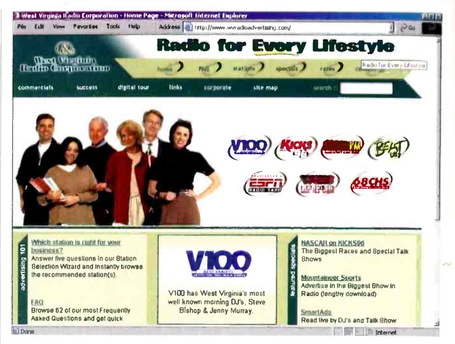
This cluster website—www.wvradioadvertising.com—is credited with helping to triple the number of inquiries from potential advertisers.

More long-term business means tighter inventory and keeps upward pressure on rates. No more need to cut deals and offer specials to move inventory at the last minute. "Now you don't have to worry about selling specials. Now you don't have to worry about