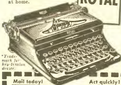
*Trademark for key-tension device.