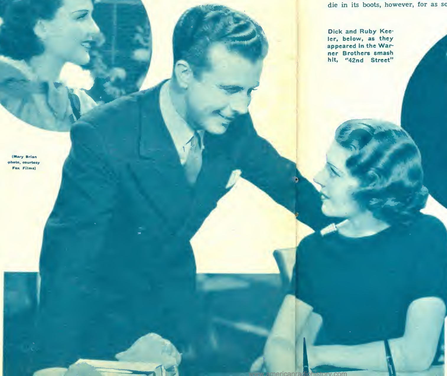
Dick and Ruby Keeler, below, as they appeared in the Warner Brothers smash hit, "42nd Street"

That was the beginning of their famous friendship, and it was the keystone to Dick's successful career as a motion picture actor, for it was Mary herself who taught him the technique of facing the camera, and it was she who was largely responsible for the