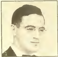
Benny Goodman See 9 p.m. EST (8 CST)