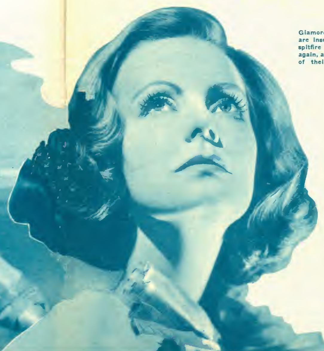
Glamorous Greta Garbo and Fifi are inseparable companions—then splitfire enemies—and inseparables again, according to the machinations of their individual temperaments