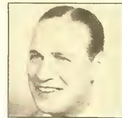
Horace Heidt See 9 p.m. EST (8 CST)