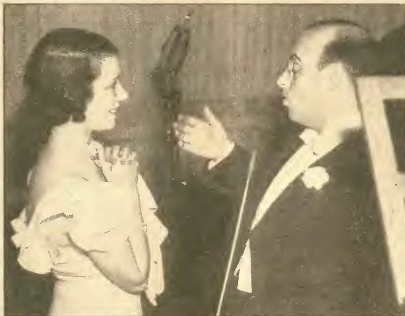
"Come to Me" is Andre Kostelanetz' demand here, and Lily Pons responds. But it's the name of his new song Lily first aired on June 3