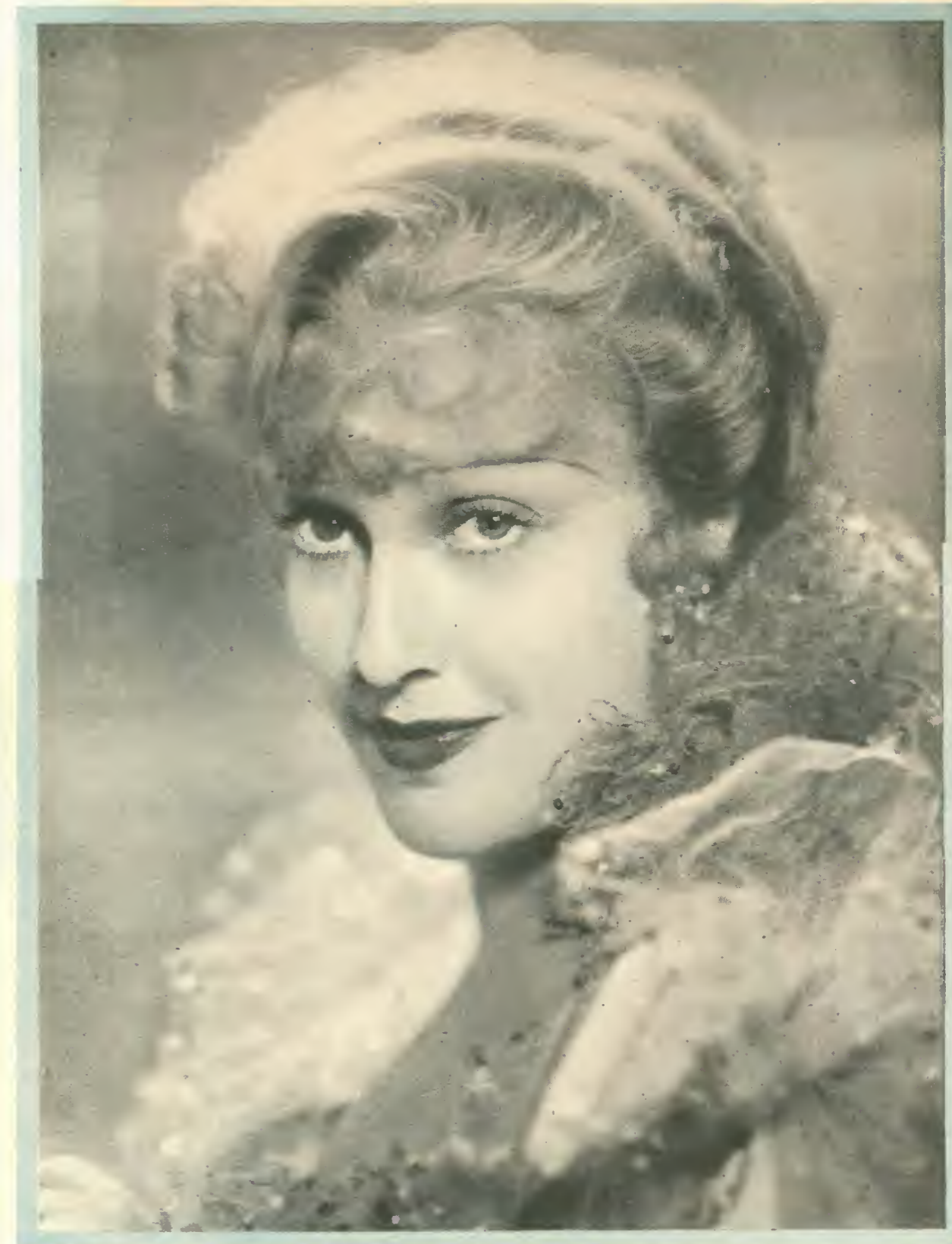
Co-starred with Eddy in his two hit films was Jeanette MacDonald, heard recently on Parties at Pickfair airing

relegate these things to my secretaries—to my help. Well, I do. I have to when I am away on tour or in the midst of production. But here is something about myself hitherto unrevealed. I have an inner compulsion. I suffer from a complex called Doing Things Myself. I can't 'relegate.' Not without great agony of spirit. I always have done everything for myself. Habit is strong. It rivets steel bands. I have always written my own letters. I have worked out my own songs. I have employed my own teachers. I have done my own studying. I have paid my own bills. I have made out my own checks. I have taken care of my personal belongings. Because I want to! Because of this inner compulsion which makes me. And now, when it comes to the point of having to relegate some things to others, it—