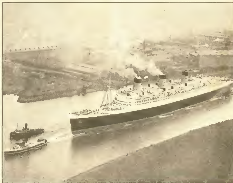
Countless broadcasts from the "Queen Mary" kept the world acquainted with her progress on her recent maiden trans-Atlantic voyage

does come back in the Fall, there is a possibility the show will be without the amateur portion. I wonder how many readers would rather have Allen do the full hour or split it with the amateurs. Let's take a vote. Drop me a post card expressing your opinion, will ya?