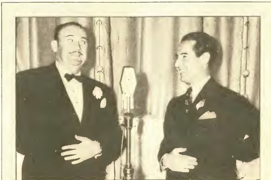
A new combination of headliners, Paul Whiteman and Frank Parker, boast of their reduced waistlines as Paul welcomes the tenor to his Varieties as a regular feature, which means added pleasure for Sunday night tuner-inners from coast to coast and then some