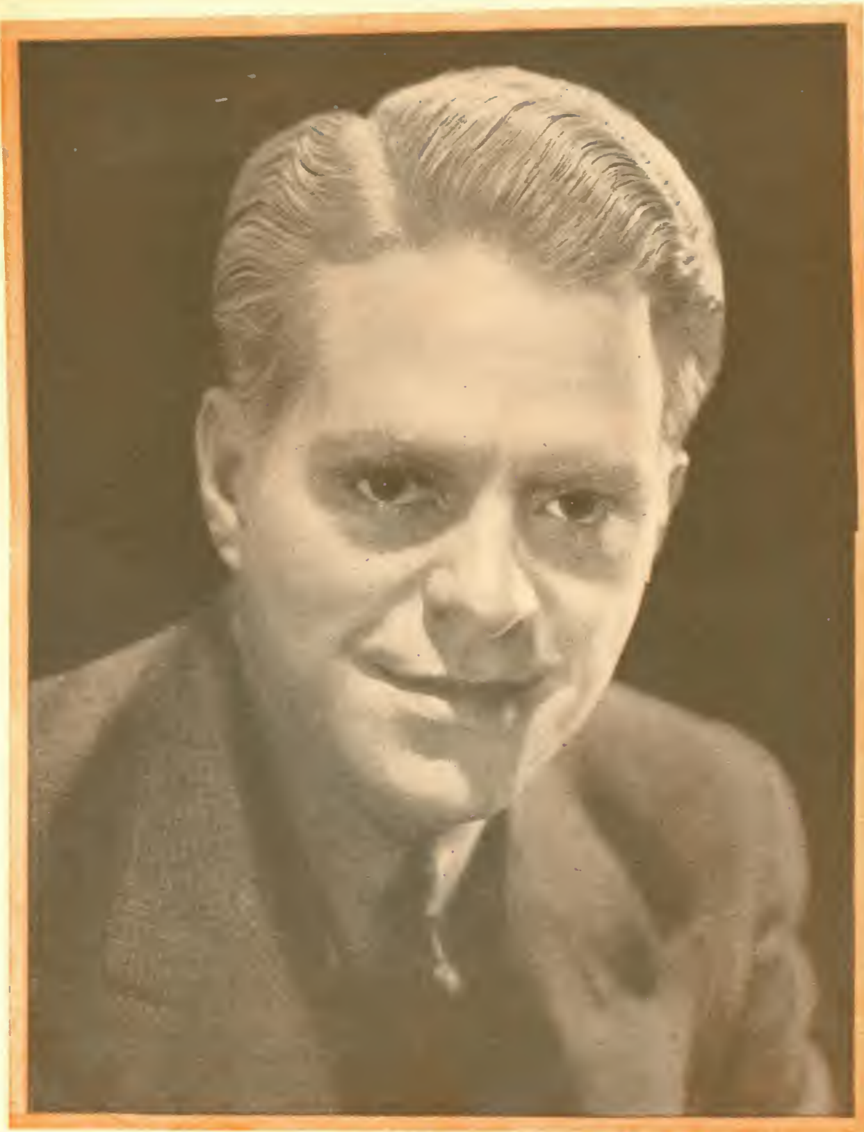
Sensational star of the screen after his appearance in "Naughty Marietta," Nelson Eddy scored another hit in the recent film, "Rose Marie." His next: "Maytime"

myself: To be the tops in all this is surely one man's whole work . . .