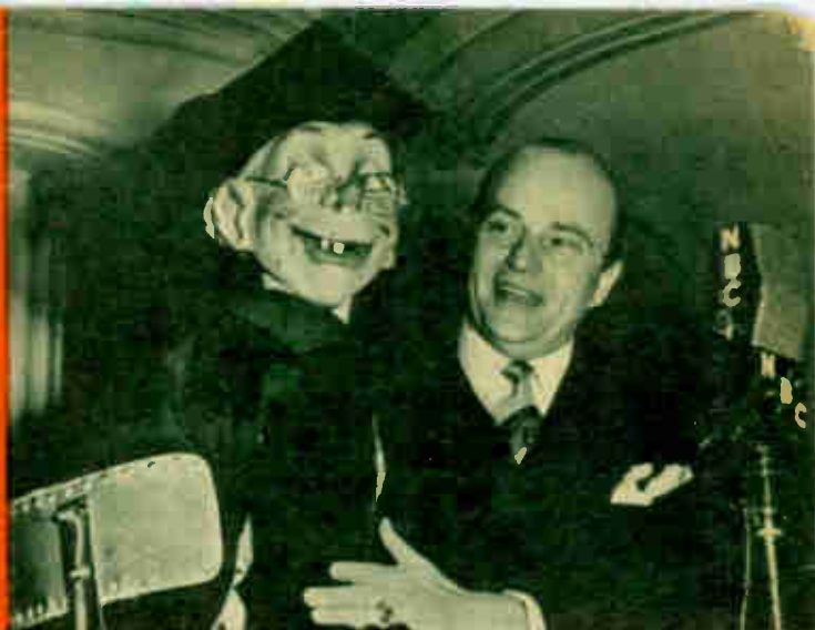
▶ AT PARTY CELEBRATING KAY KYSER'S tenth radio anniversary with "College of Musical Knowledge," Edgar Bergen and Mortimer Snerd entertained. Must-donned cap and gown in deference to Ye Prof.