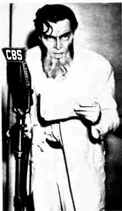
↑ IN 1938, ORSON WELLES rushed over from his Broadway hit, "Heartbreak House," in full make-up to play "Romeo" in an air version of "Romeo and Juliet."