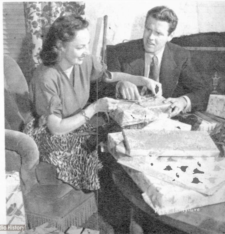
December 25, 1948