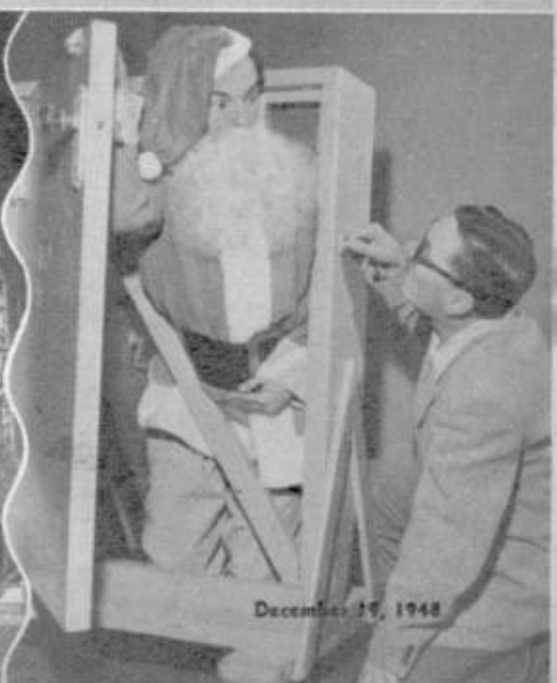
December 19, 1948