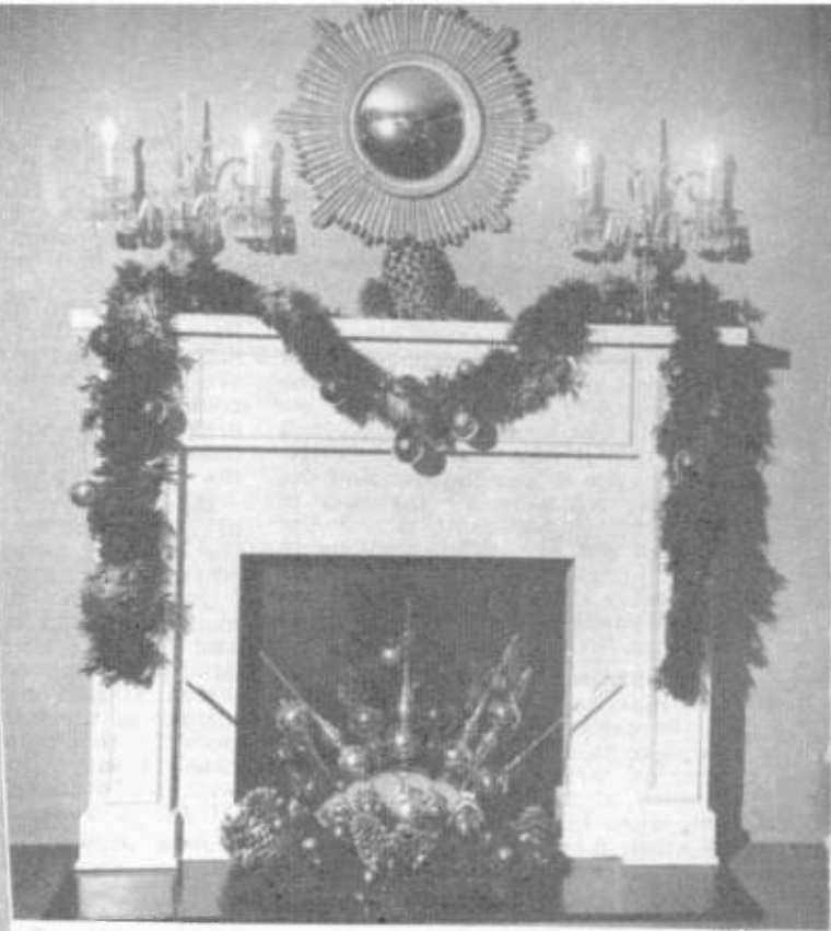
▲ OLD ST. NICK STILL COMES DOWN the chimney in most homes, so it is highly important to deck the hearth and mantel to make him feel at home. Here is a simply executed decoration that will withstand the rigors of the entire holiday season. Note hearth arrangement with bamboo stick used for threading ornaments.

▲ CHRISTMAS DECORATIONS should not be confined solely to the home's interior. It is nice to spread holiday cheer by sharing your holly and Yule glitter with neighbors and passers-by. So deck your doorway in something cheery and inviting—maybe metallic paper with stars and a fat wreath.