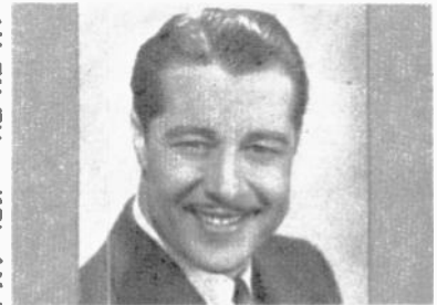
DON AMECHE Host of "Holiday Star Time"

It's a festive, two-hour package of good cheer and entertainment that's coming right into your home from 2:00 to 4:00 P.M. on Christmas Day—goes under the name of "Holiday Star Time." Perhaps you remember the gala entertainment in previous years. Christmas, 1948, will be even more enjoyable with many of your favorite screen, radio and stage stars returning plus some new faces on the Yuletide scene.