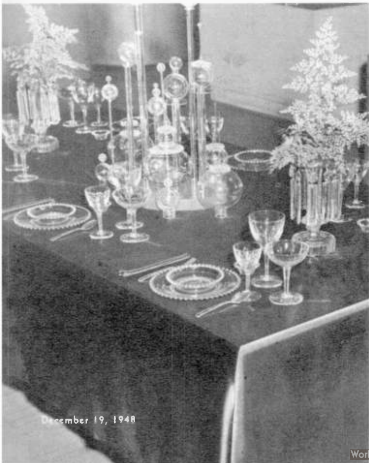
December 19, 1948