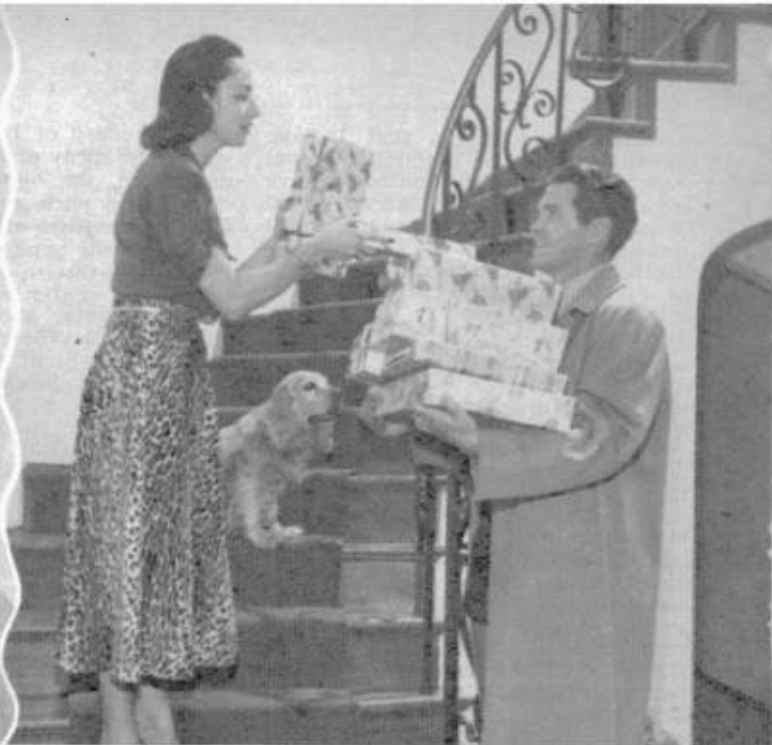
🏠 IN-PERSON CHRISTMAS DELIVERIES are the feature of Mr. and Mrs. Jack Smith's Christmas plans. Vicky and the pup take care of the organizing while the CBS singing star takes over the mailman's job.