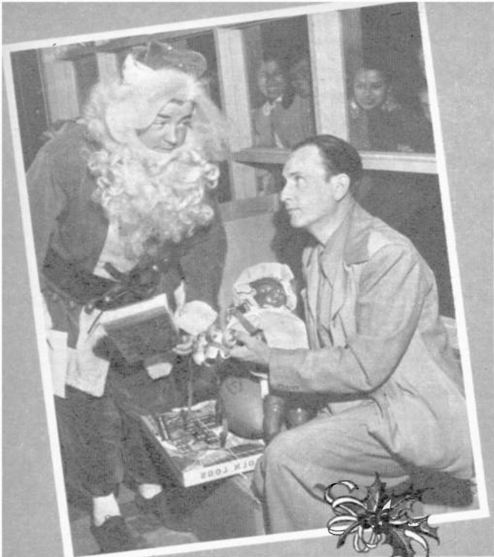
◀ BUD ABBOTT AND LOU COSTELLO cite this instance of playing Santa as their most memorable Christmas. The occurrence was the Christmas party at the Lou Costello, Jr., Youth Foundation.