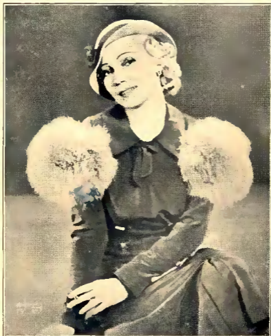
GILDA GRAY (Story on Page 27)