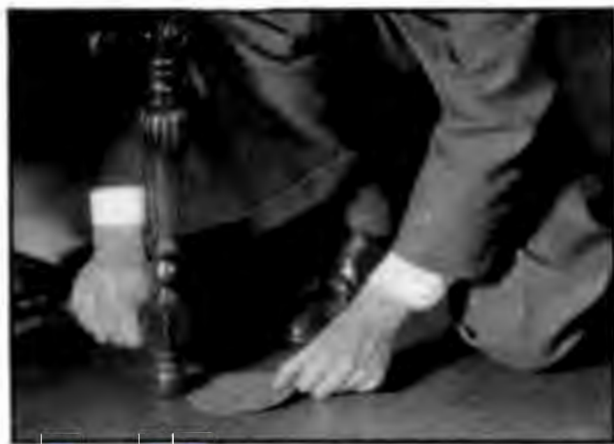
Felt pads under a set will often aid in minimizing unpleasant noises