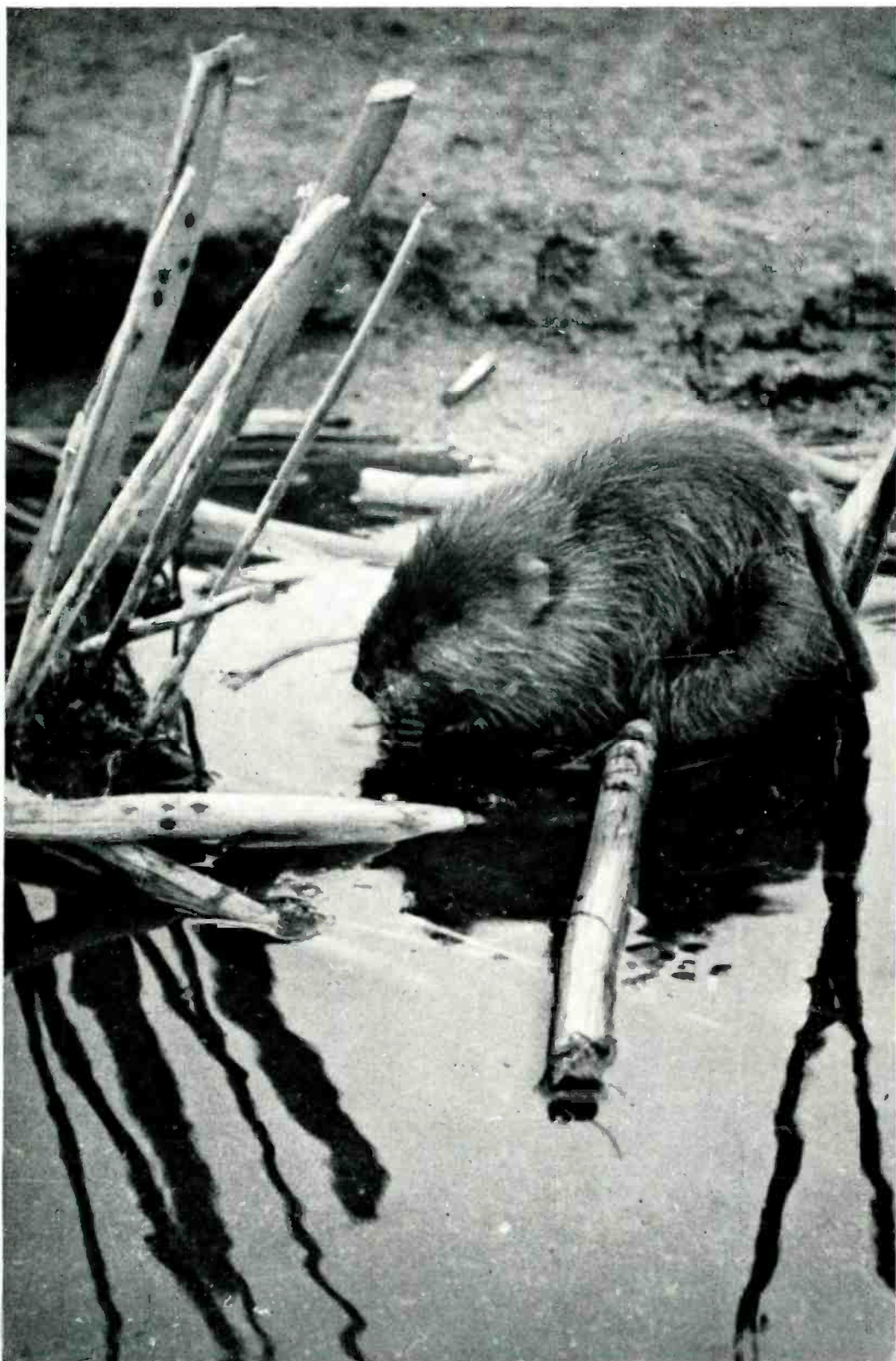
Muskrat Eating Bulrush Roots