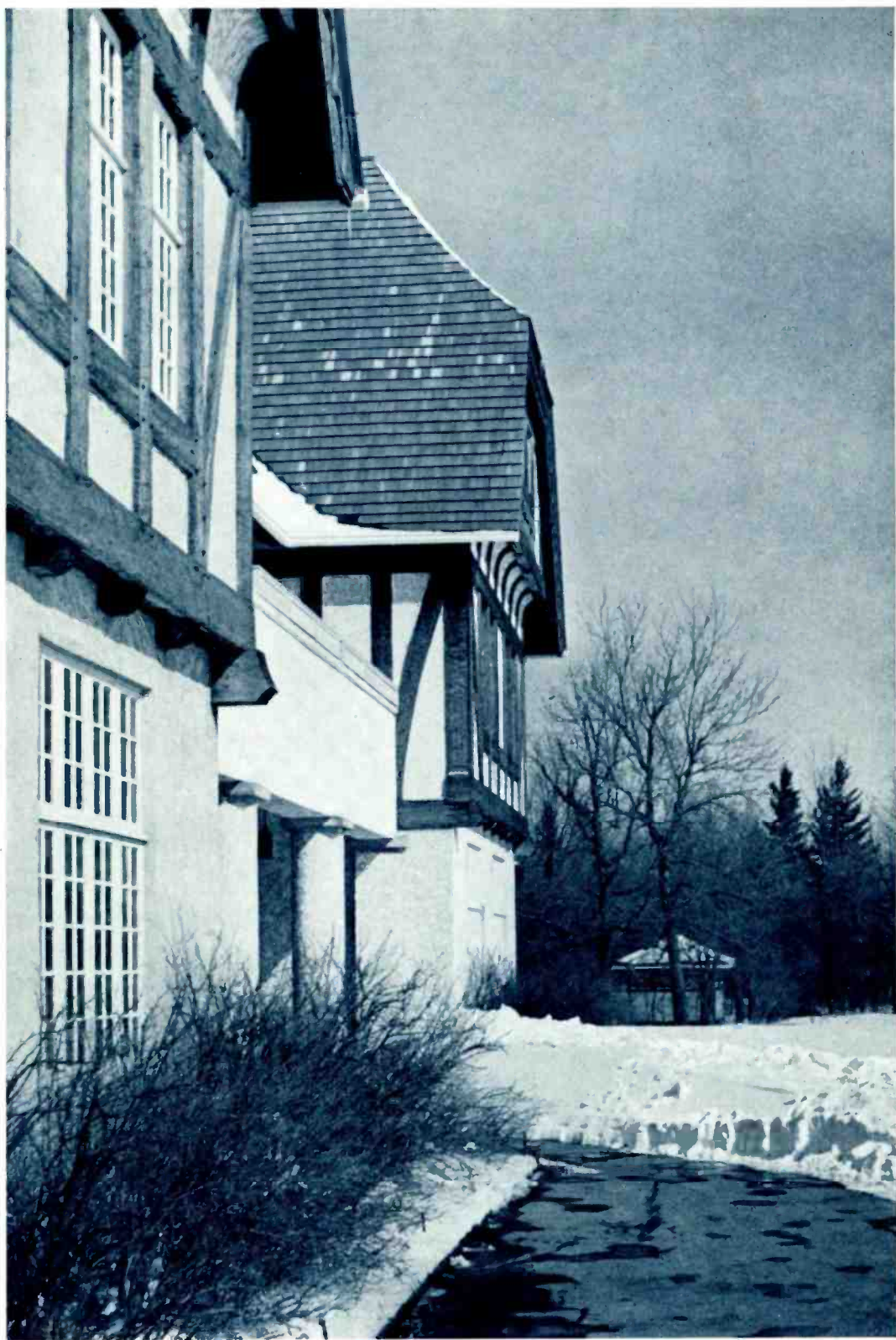
Pavilion, Assiniboine Park, Winnipeg