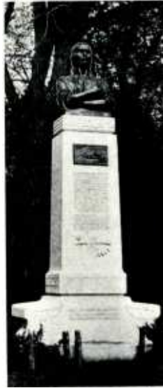
"Peguis" Monument in Kildonan Park, Winnipeg.

It is difficult for us today to realize the terrible hazards and the dangerous loneliness of the vast prairies in those early days. Once the Lagimodieres were surrounded by a savage band of Sarcee Indians on their way to avenge the killing by Crees of several of their warriors. Five of their people had gone to