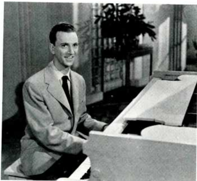
Bert Pearl of the Happy Gang