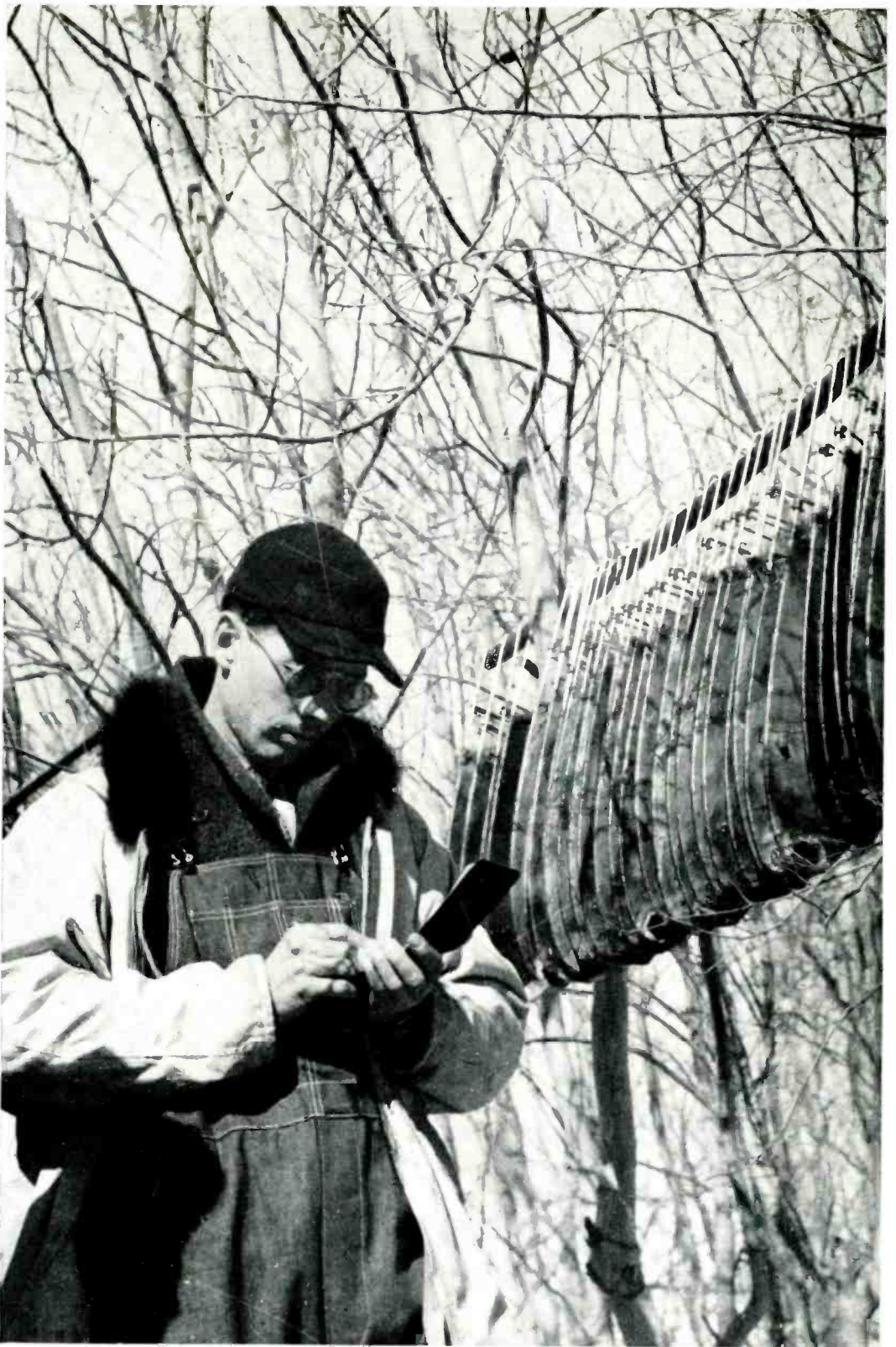
Drying Muskrat Skins