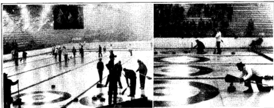
Scenes at Macdonald Briar Canadian Championship Game

Now one of Manitoba's most popular sports, in season, the game of curling began in this province in the year 1876 with the organization of a club in Winnipeg. As a matter of history it is recorded that the first game was played on December 11th, that it lasted two hours, and that the losers duly fulfilled their agreement to donate a barrel of oatmeal to the Hospital.