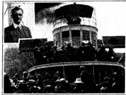
Returning aboard the "Cayuga". Inset, the author.

bond of comradeship. We wireless men who have done a few tricks on the landlines have always had a feeling of respect for the older men who pounded brass in earlier days and whose skill and accuracy in the art of handling telegraph traffic was amazing. The old-time line telegraphers are to the modern operators of automatic systems what the men of sailing ships are to those who now go down to the sea in mechanized steel hulls. So, when I was ordered to leave my booth for a day and