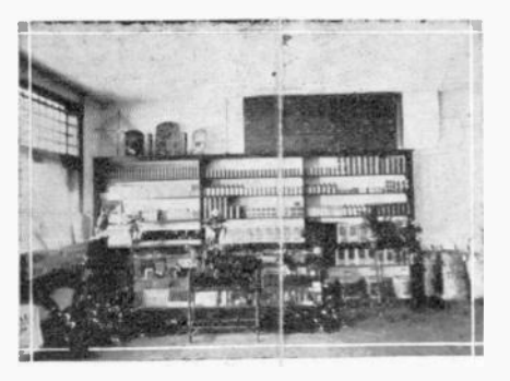
CORNER OF FEDERAL DISPLAY ROOM