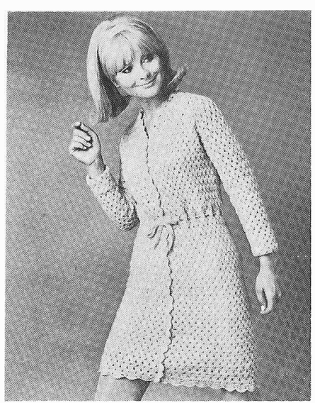
and crochet. For these patterns, simply send 10¢ plus your name, address, and zip code to APRIL PATTERNS, KMA GUIDE, Shenandoah, Iowa, 51601.