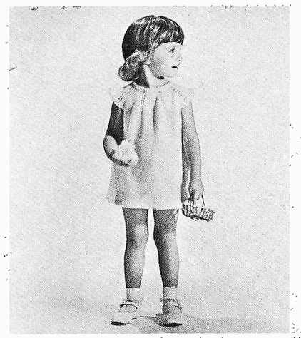
This spring's dressing starts now with this fresh batch of dress patterns to knit