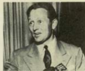
Art Linkletter, super m-c each weekday on "G. E. HOUSEPARTY"