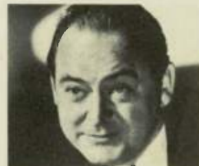
Edward Arnold, he makes history live on "MR. PRESIDENT"