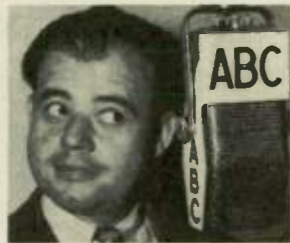
Zeke Manners, mad maestro of "THE ZEKE MANNERS SHOW"