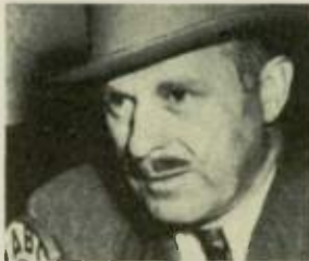
Drew Pearson, nominated for this year's Nobel Peace Prize