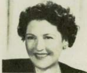
Louella Parsons talks to stars — and of them — each Sunday

FOR YOUR USE AS A DAILY GUIDE TO BETTER LISTENING