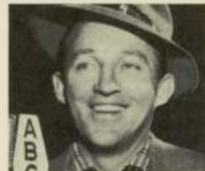
Bing Crosby, you hear the world's most popular guy on "PHILCO RADIO TIME"