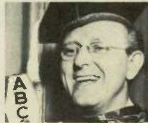
Kay Kyser, Mon. thru Fri., prexy of "THE COLLEGE OF FUN AND KNOWLEDGE"

That 2,700 word RICHFIELD REPORTER newscast you hear nightly except Saturday is the result of careful editing of more than 70,000 words of news bulletins. That's what makes THE RICHFIELD REPORTER such a good way to top off your listening day. Remember, it's traditionally at 10 p.m.