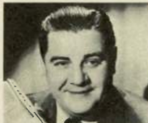
Jack McElroy, 200 lb. host of "BREAKFAST IN HOLLYWOOD"