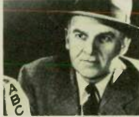
Walter Winchell, he tops all national programs in popularity

SATURDAY has so many top-flight shows that it's difficult to pick the winners . . . but by all means, start your day with "WHAT'S MY NAME" with Arlene Francis and Johnny Olsen. It's now on the air at 8:30 in the ayem after being a Saturday night favorite for almost a year.