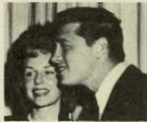
Gordon MacRae, handsome host of "THE RAILROAD HOUR"