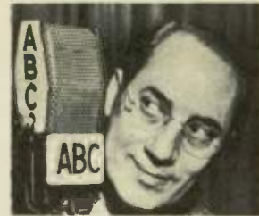
Groucho Marx, a sure bet for laughs in "YOU BET YOUR LIFE"