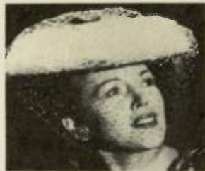
Fran Allison, giddy "Aunt Fanny" of "THE BREAKFAST CLUB"