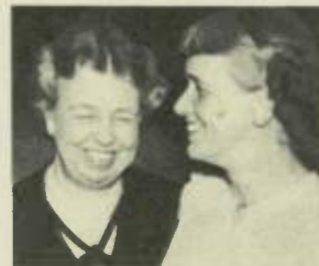
Eleanor and Anna Roosevelt, they speak five times a week