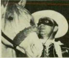
"THE LONE RANGER," he keeps his real identity a mystery.