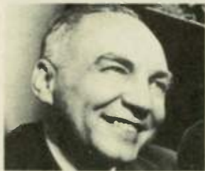
George V. Denny, heads famed "AMERICA'S TOWN MEETING OF THE AIR"

ABC stars, Groucho Marx, Art Linkletter, and Jo Stafford all say, "I'll join you at 10:00 p.m.!" That's listening time for "THE RICHFIELD REPORTER," the Coast's most popular nightly-except-Saturday newscast . . . traditionally at 10:00 p.m. on your ABC station. So end your day right — with the best news at night.