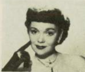
Jane Wyman, representing hundreds of top "THEATRE GUILD" stars