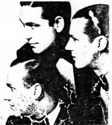
TOM, DICK AND HARRY