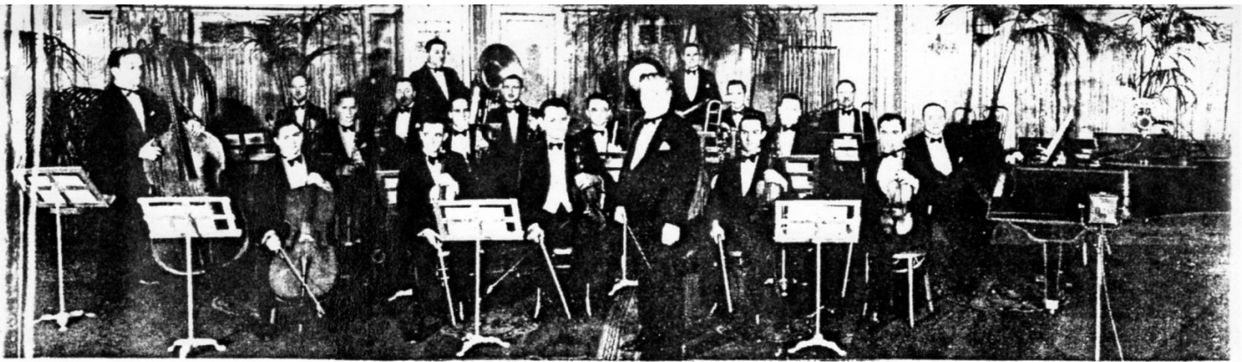
THE W-G-N CONCERT ORCHESTRA