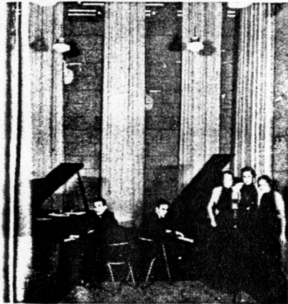
THE DORING SISTERS IN STUDIO A