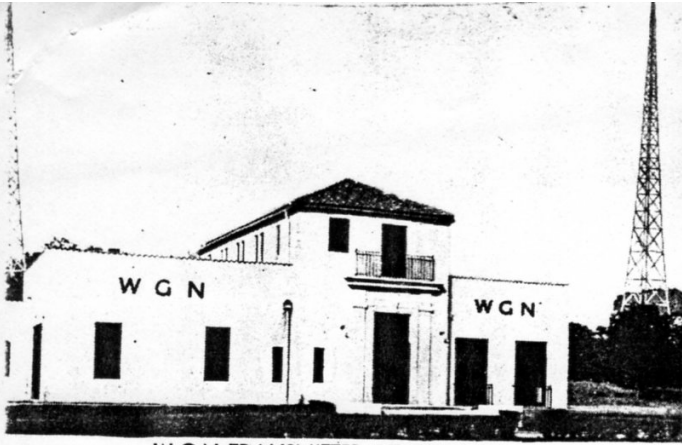
W-G-N TRANSMITTER AT ELGIN, ILL.