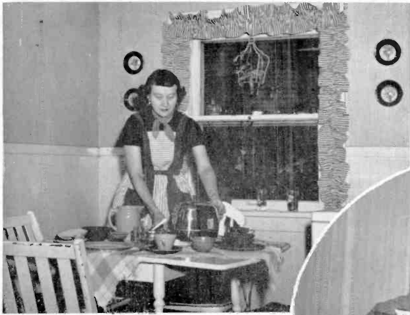
It's breakfast time— and breakfast's ready!