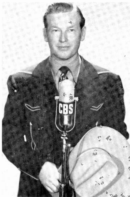
Rex Allen, star of the "Rex Allen Show" at 9:00 p.m. Fridays, composes most of his own songs. He has had three hundred published to date.

And Paul Revere was stamped by it into the memory of every succeeding generation of Americans as a stirring hero of battle and exciting adventure—Paul Revere, who in real life was a quiet hero of peace and a pioneer of industrial America!