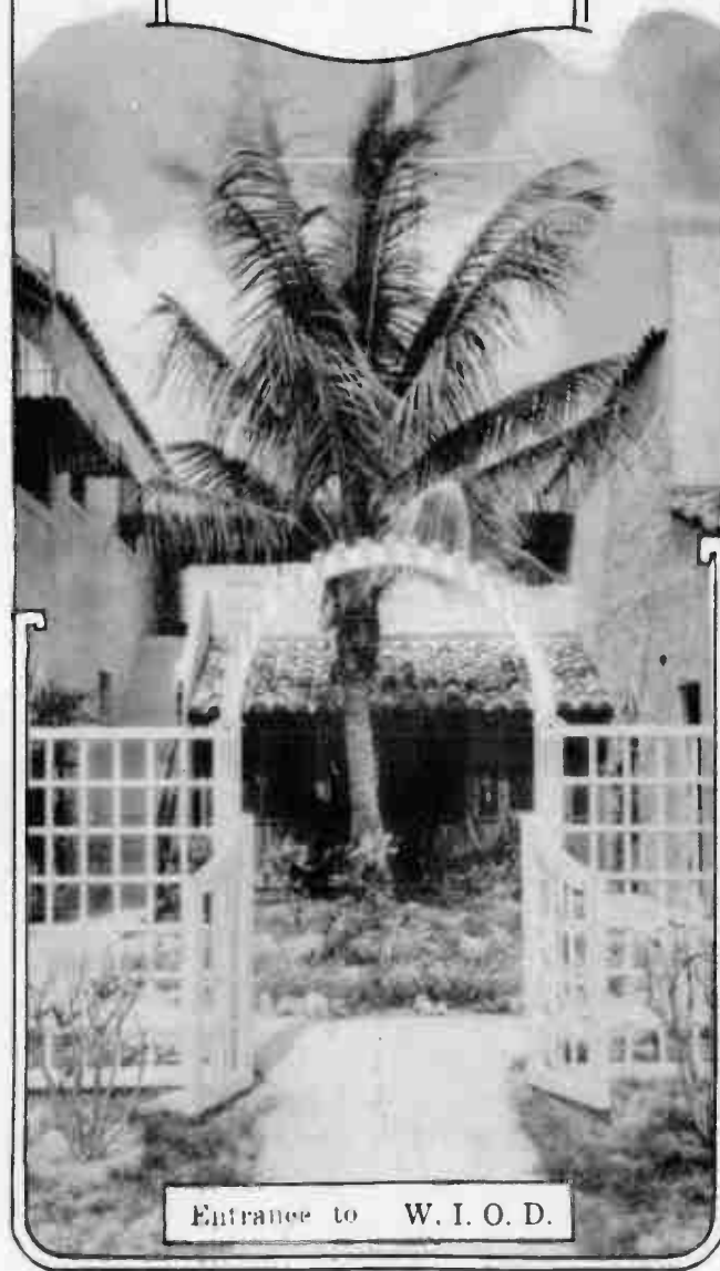
Entrance to W. I. O. D.

Radio Station WIOD is the community broadcasting station of Miami Beach, Florida, owned and directed by The Carl G. Fisher Company.