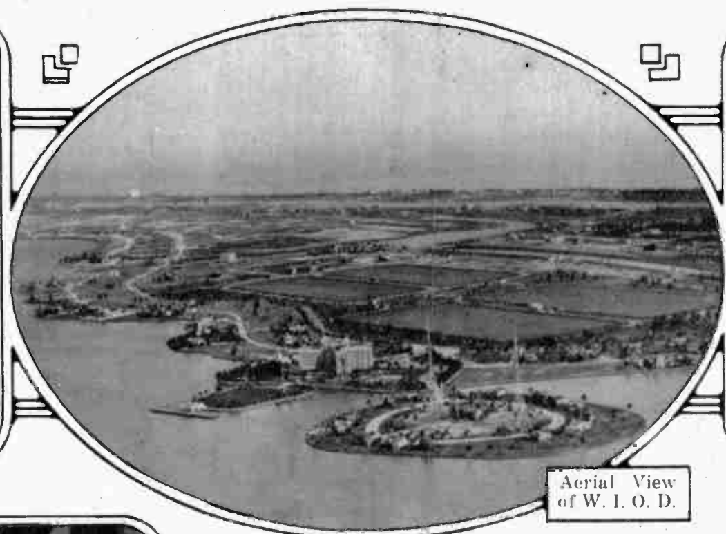
Aerial View of W. I. O. D.