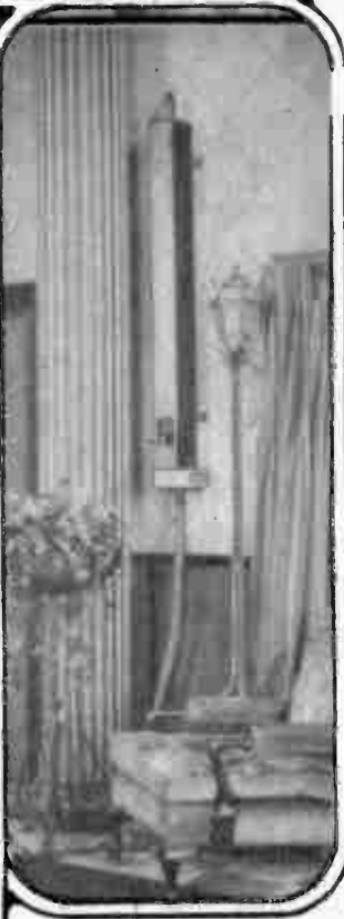
Ocean Liner's Whistle.