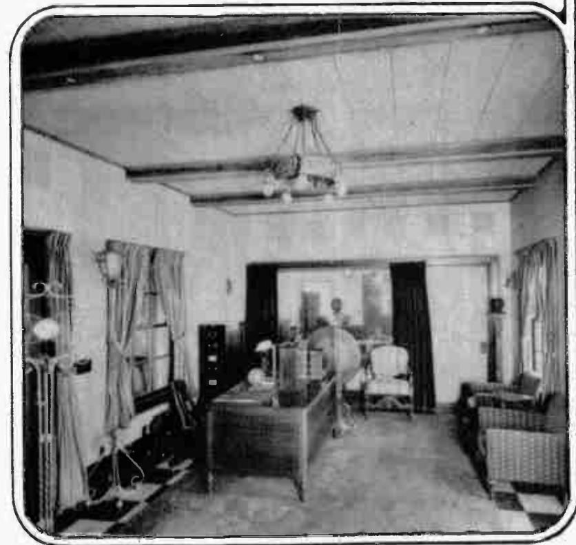
Reception Room and Auxiliary Studio.

W. I. O. D. 230.6 W. I. O. D. operates on a wave length of 217.8 meters, or 1,210 1,300 kilocycles, from 8:30 p. m. to 12:30 a. m. (Eastern Standard Time) every night except Sunday, featuring music and other entertainment from leading hotels and theatres. All announcing is done by Special Remote Control for all points outside the studio. W. I. O. D.'s towers are 250 feet high. The station is located on an island surrounded by salt water, with 70,000 feet of wire buried and submerged in salt water, giving it the most perfect ground system in existence. The General Broadcasting Room is believed to be the most thoroughly sound-proof room in the world. Nautilus, Flamingo, King Cole, Lincoln and Boulevard, all Carl G. Fisher hotels; the Pancoast and Roney Plaza hotels, all at Miami Beach, and the Cinderella Ballroom and Olympia Theatre in Miami are connected with the studio by remote control.