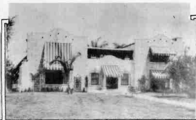
Mico Roto Corp's, News Tower, Miami.

Reception of WIOD is acknowledged in England, South America, Central America, Mexico, Canada and all points in the United States.