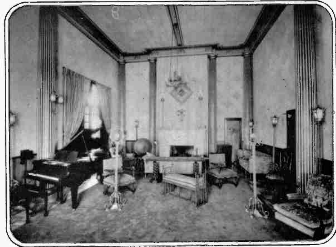
W. I. O. D.'s Main Studio.

W. I. O. D. 230.6 W. I. O. D. operates on a wave length of 217.8 meters, or 1,210 1,300 kilocycles, from 8:30 p. m. to 12:30 a. m. (Eastern Standard Time) every night except Sunday, featuring music and other entertainment from leading hotels and theatres. All announcing is done by Special Remote Control for all points outside the studio. W. I. O. D.'s towers are 250 feet high. The station is located on an island surrounded by salt water, with 70,000 feet of wire buried and submerged in salt water, giving it the most perfect ground system in existence. The General Broadcasting Room is believed to be the most thoroughly sound-proof room in the world. Nautilus, Flamingo, King Cole, Lincoln and Boulevard, all Carl G. Fisher hotels; the Pancoast and Roney Plaza hotels, all at Miami Beach, and the Cinderella Ballroom and Olympia Theatre in Miami are connected with the studio by remote control.