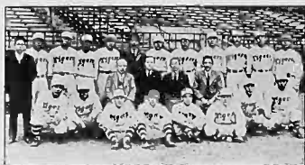
The Hanshin Tigers in the 1930's

Baseball in Japan, WNYC TV, Monday, July 11, 8pm