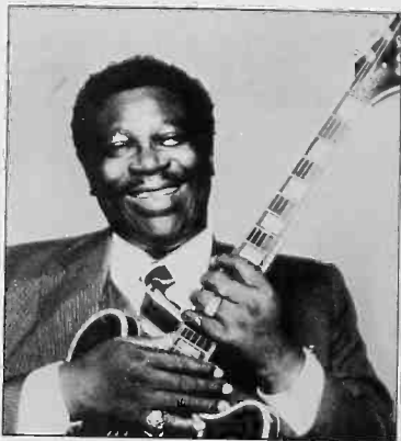
B.B. King Live at Woodlands, July 25 at 8pm

WNYC-TV presents the sounds of music with series and specials crossing all genres throughout July and August