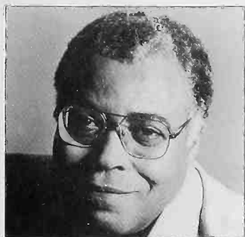
James Earl Jones