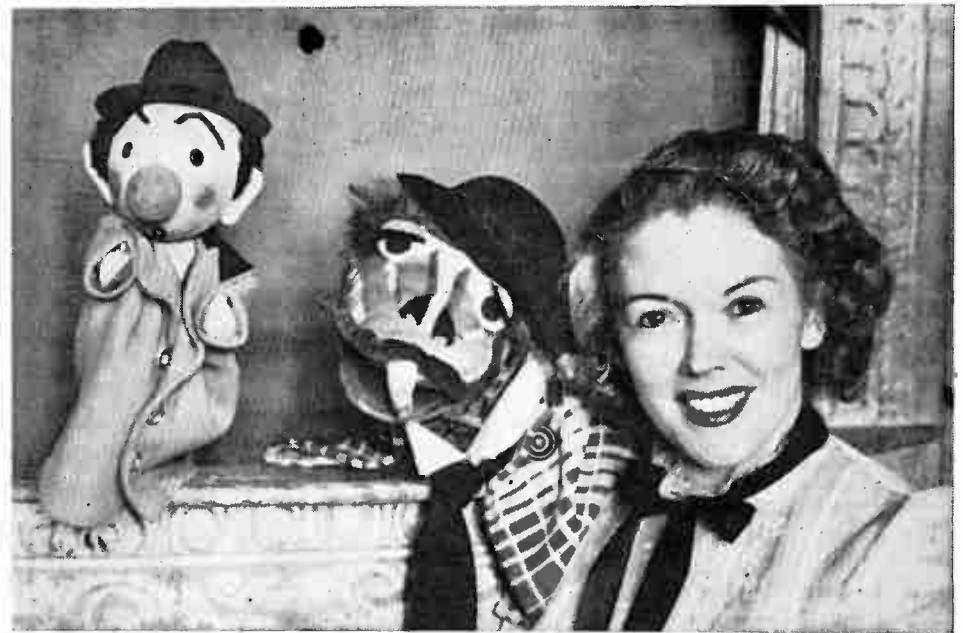
Another great NBC television show, "Kula, Fran and Oillie, is already a favorite with WOW-TV viewers. This RCA Victor show stars two cute puppets, Kula and Oillie.