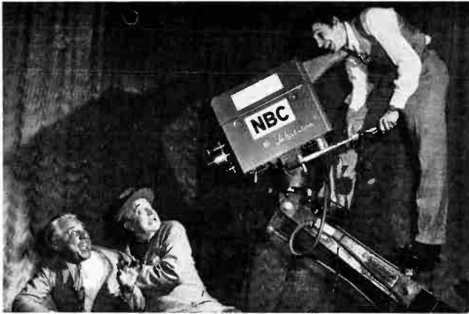
The two zaniest comics in show business, Olson and Johnson, star on the Buick TV show on NBC network (shown the other night on WOW-TV).