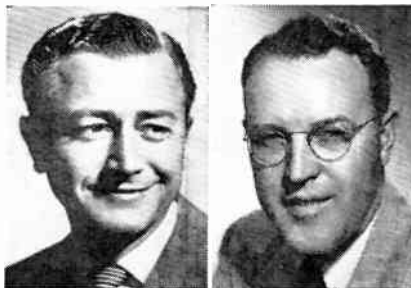
These handsome lads will be heard on two new NBC feature shows, Robert Young in General Foods' "Father Knows Best" (August 25) and George Hicks (right) emcee of the Theater Guild dramas September 11 for U. S. Steel.