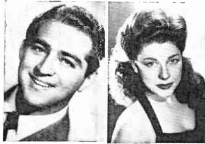
Comedienne Judy Canova whose Colgate show will return to WOW October 1 and Robert Merrill, the popular baritone NBC guest star.