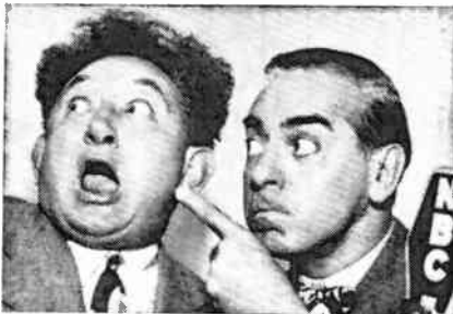
"Banjo Eyes" Eddie Cantor who'll be quizmaster for Eversharp's "Take It or Leave It" starting on WOW September 11, and "The Mad Russian."