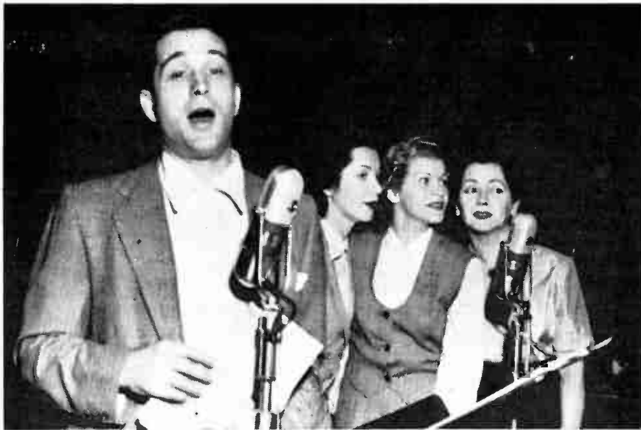
Perry Como and the Fontane Sisters will be both radio and television stars on WOW and WOW-TV. Their Chesterfield radio show, a Thursday nighter, starts September 15.