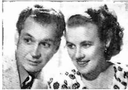
Radio's greatest man-and-wife comedy team, Fibber McGee and Molly will be back for Johnson's Wax, September 13, 8:30 p.m.

Flower fanciers have shown great interest in Bab-O's offer on the "Lora Lawton" show, 10:45 a.m., Mondays through Fridays on WOW. Bab-O offers six genuine Royal Rainbow tulip bulbs imported from Holland or 25 cents and a Bab-O or Glna label.