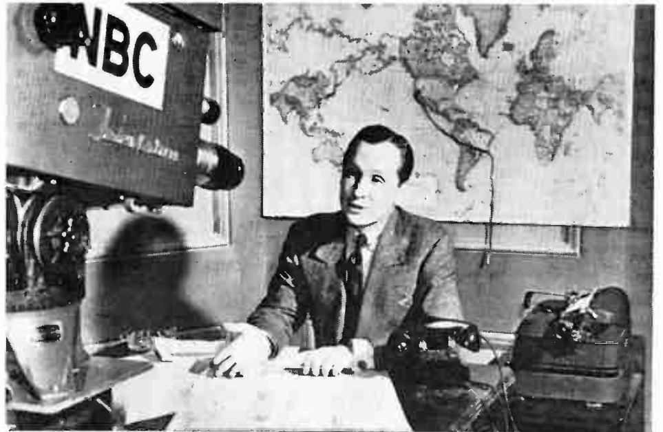
"Who Said That?" familiar to radio listeners, will star John Cameron Swayze, on television. John may also be starred soon in a new Camel news show on NBC television.