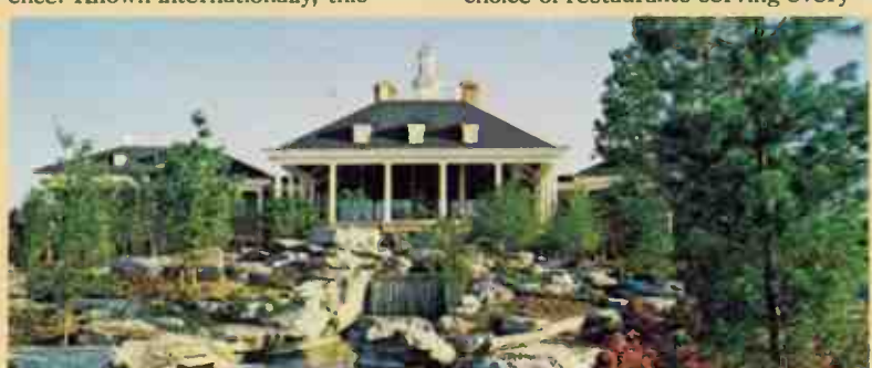
Opryland U.S.A. and Opryland Hotel are properties of the SI Corporation

Mobil Four-Star hotel features several lounges to suit any mood and a choice of restaurants serving every-