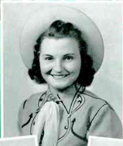
"LITTLE SHIRLEY" "WVVA's Sweet Personality"