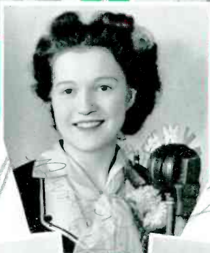
BROWN- EYES "The Sunshine Girl!"