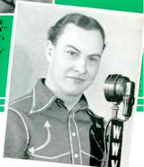
BILL JONES "Originator of the Silver Yodel"