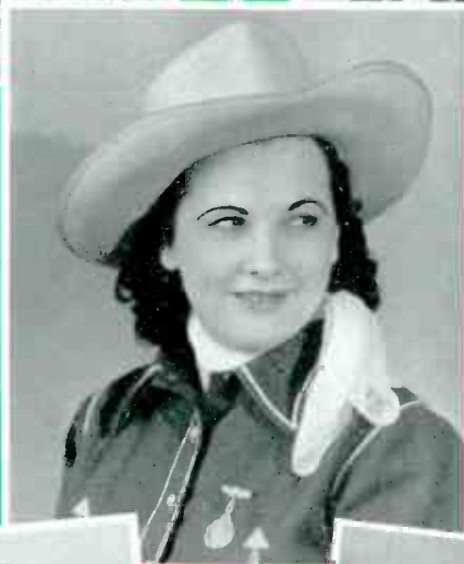
SUN- FLOWER "The Girl with the Sunny Disposition"