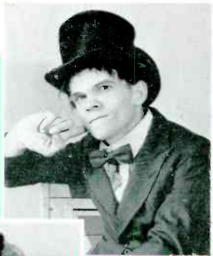
"QUARANTINE" "The Ugliest Man in Radio"