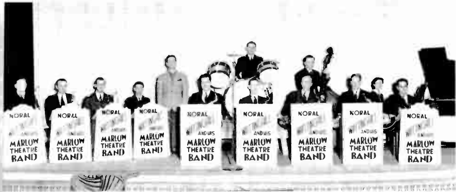
My first band in Montana. What else does one do in winter?