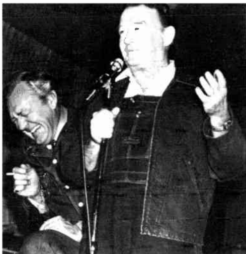
Forrest Tucker always enjoys my "dirty" jokes.