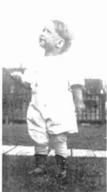
What could I do wrong? I was only 1 year old.