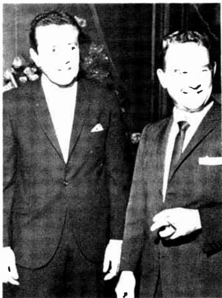
They asked if they could bring along a nice Italian boy singer. I thought it was Sinatra! (Vic Damone)