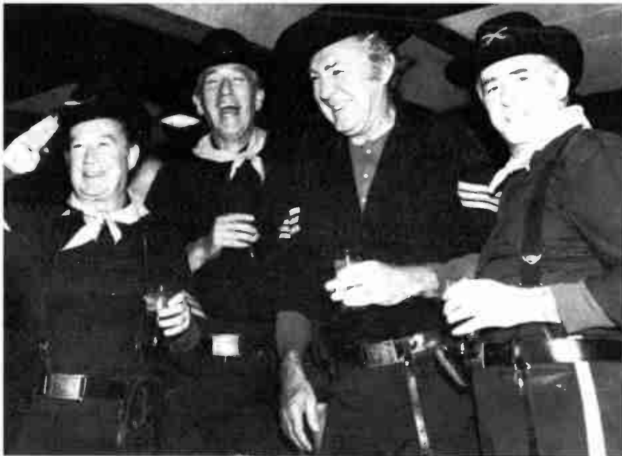
Fun at Lakeside. We honored Forrest Tucker this night for his "F-Troop" series, by drinking all the booze before he arrived.