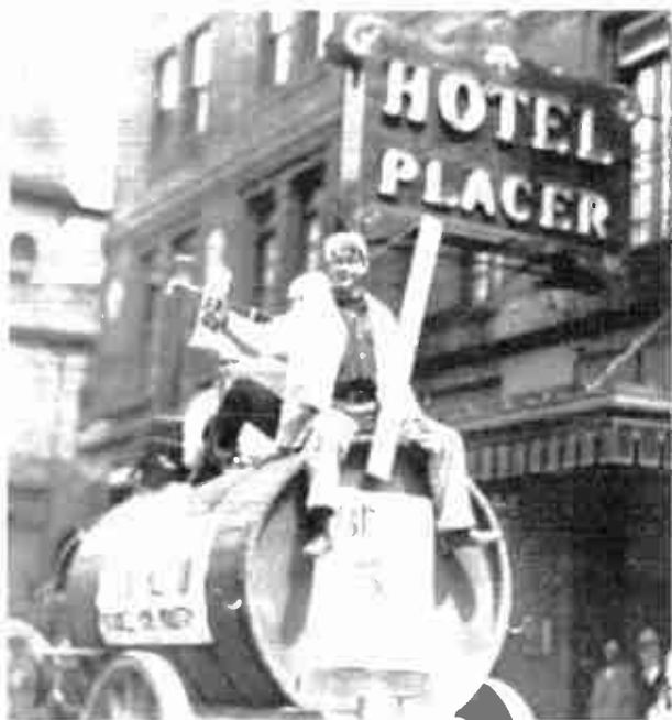
I always did love a gag. My high school fraternity agreed that if I did this pose, I could have all the beer I wanted. The start of a true guzzler!