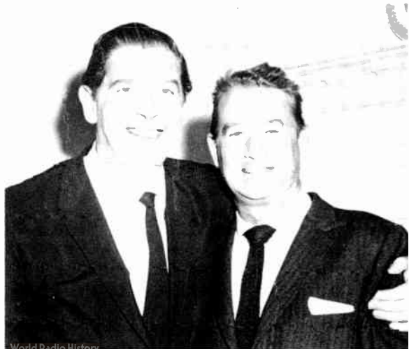
"... he wouldn't have the nerve to steal my jokes." (Milton Berle)