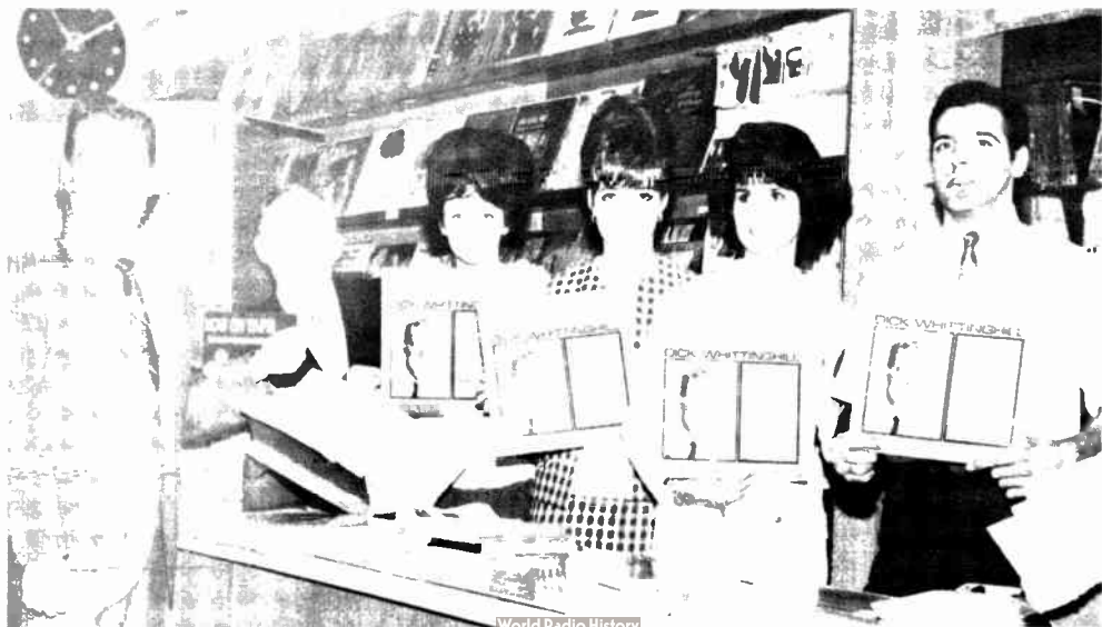
Being a red-blooded true American square, I had to promote my first and only album—"The Square."