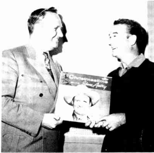
My favorite employer for 25 years, Gene Autry.