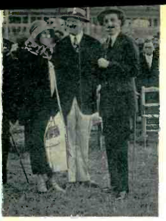
With former King Alfonso