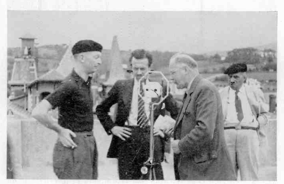
H.V.K. and engineers on hotel roof in Hendaye, France, on the Spanish frontier, from which H.V.K. made one of his famous 1936 battle broadcasts.