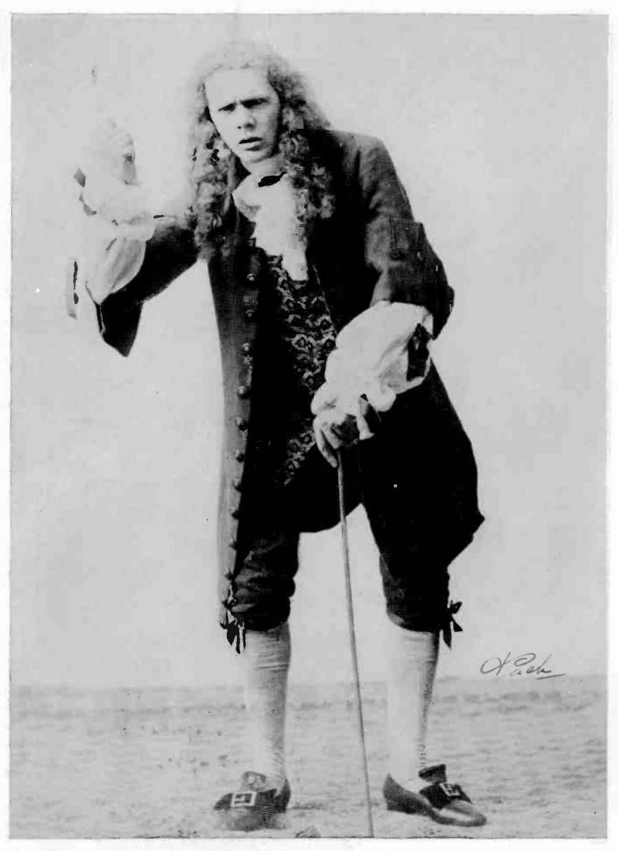
At Harvard, thespian H.V.K. in a Molière play (1906).