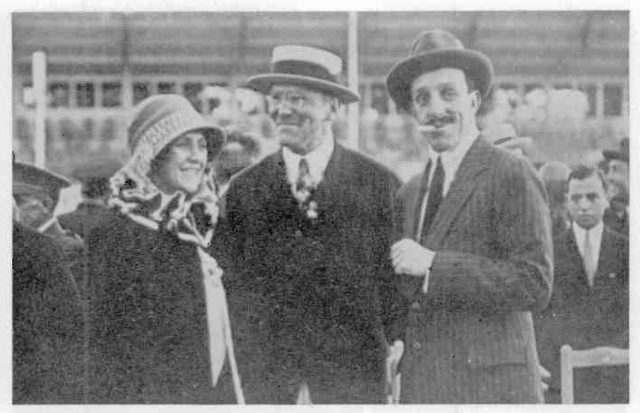
H.V.K. and his wife, Olga, chat informally with King Alfonso XIII at a polo match in Spain (1926).