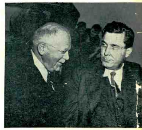
With Wendell Willkie