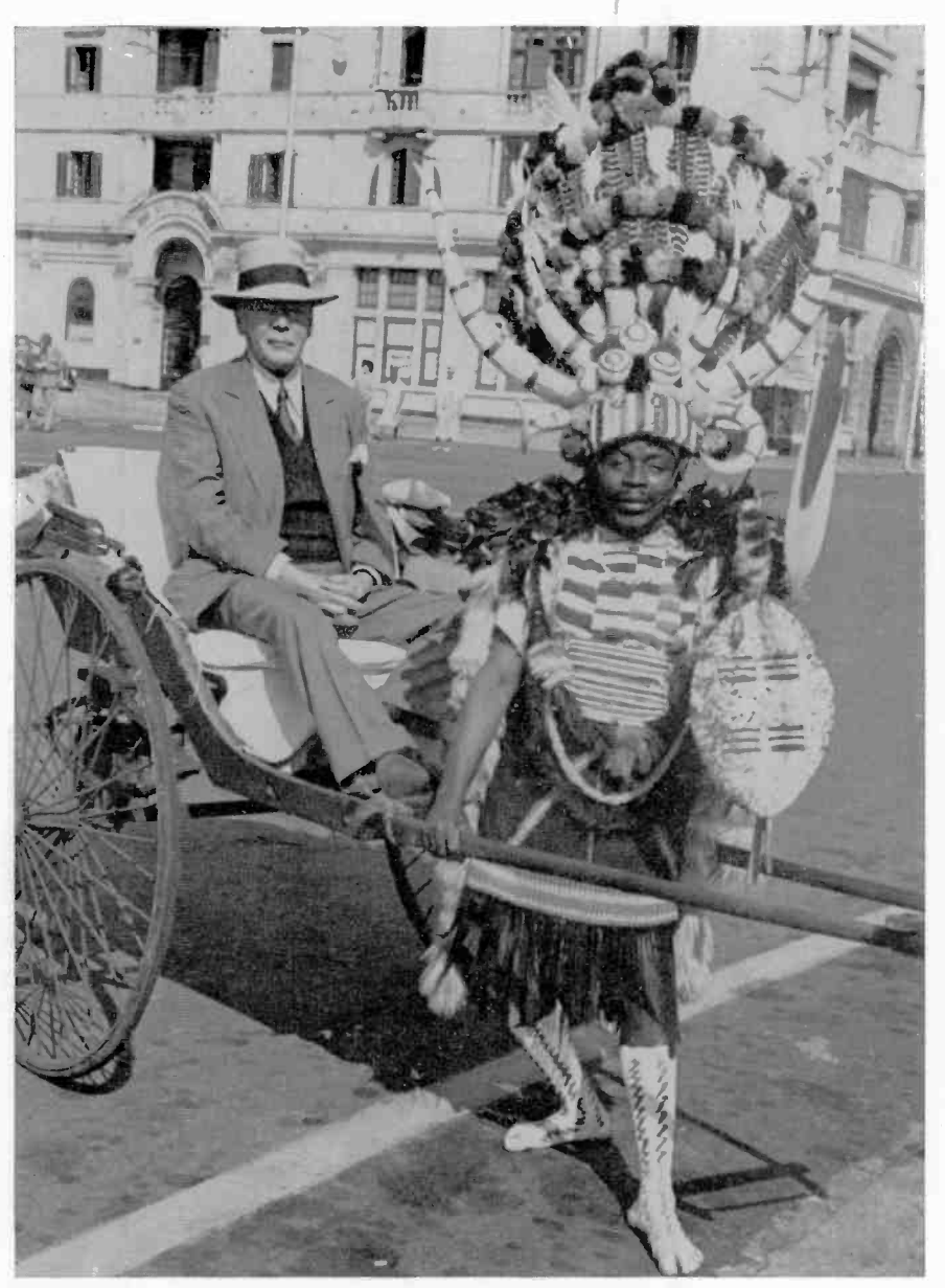
H.V.K. on a rickshaw ride in Durban, South Africa, being pulled by a Zulu chief.