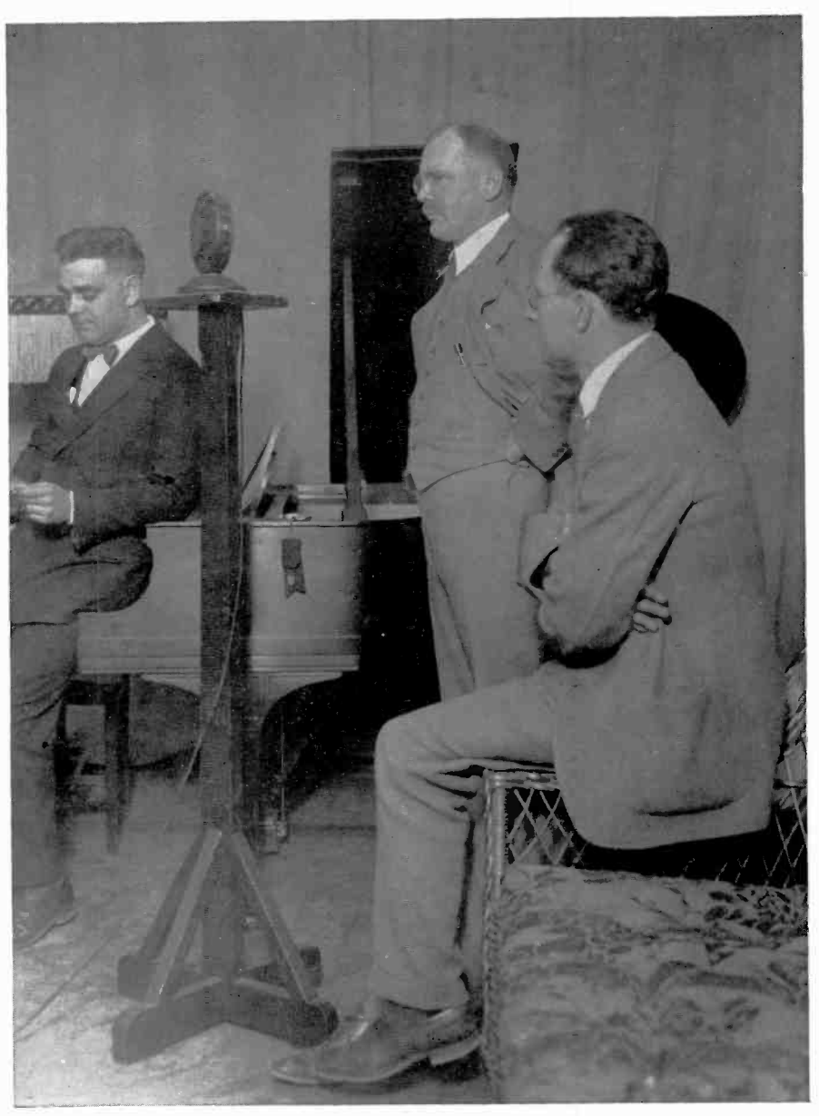
H.V.K. faces one of the early carbon microphones (1924).