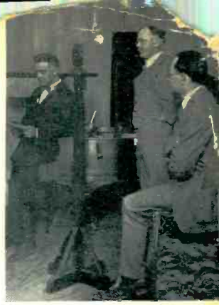
Broadcasting in 1923