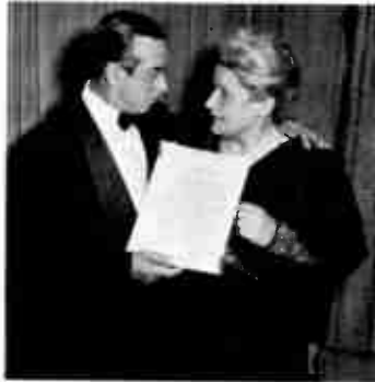
( N.B.C. )