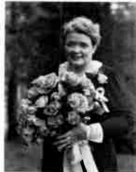
( Jackson & Perkins Co. )