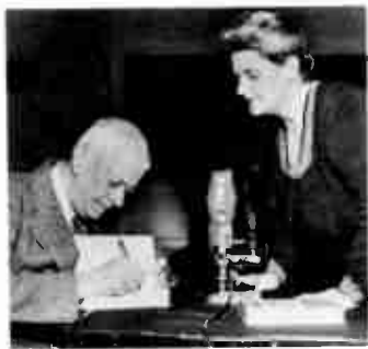
Carl Van Doren