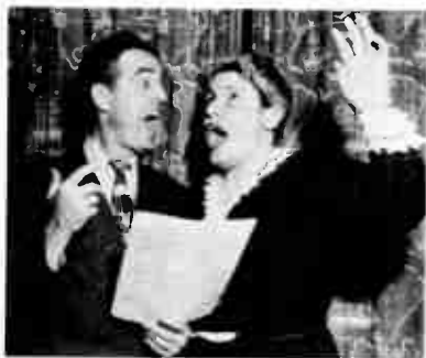
Fred Waring (Cosmo-Sinec)