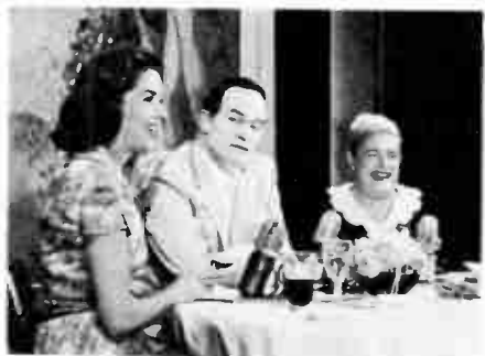
Bob Hope and Jinx Falkenburg