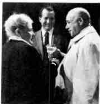
David Sarnoff and Tex McCrary.