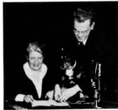
Sinbad, author of Sinbad of the Coast Guard.