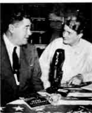
Quentin Reynolds