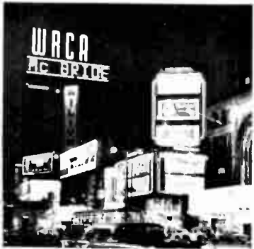
( Abstract )