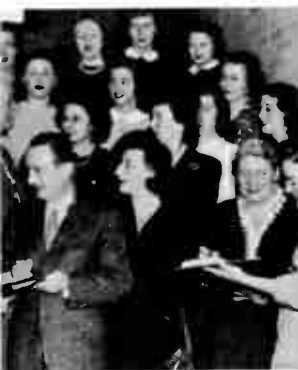
Book and Author Victory Loan Rally, Buffalo, N.Y.