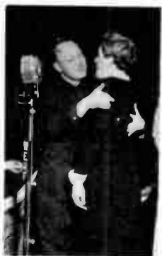
(Cosmo-Sileo) Russel Crouse