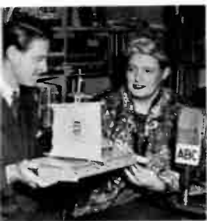
Thor Heyerdahl, author of Kon-Tiki.

"Authors are so at ease they frequently forget they are broadcasting . . . an all-out McBride recommendation is reflected immediately in the sale of a novel or autobiography"— Bennett Cerf