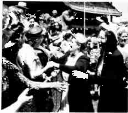
Fifteenth anniversary, Yankee Stadium.