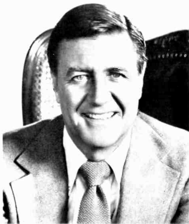
ELTON H. RULE, President, ABC, Inc.