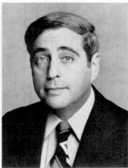
FRED SILVERMAN: His contribution to ABC's success catapulted him to the Presidency of NBC.