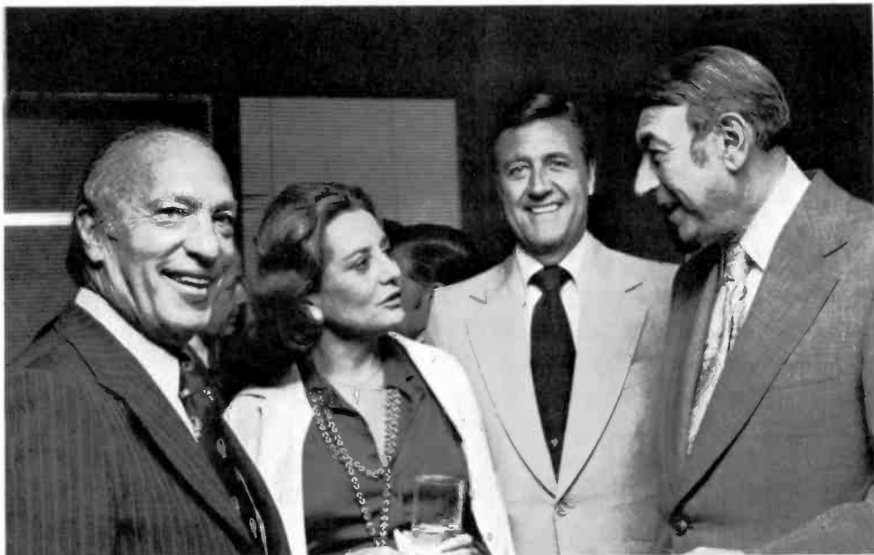
BARBARA MAKES HEADLINES—AND WAVES: When she joined ABC in July, 1976. Shown here at the announcement party with Chairman Goldenson, President Rule, and ABC's ubiquitous Howard Cosell.