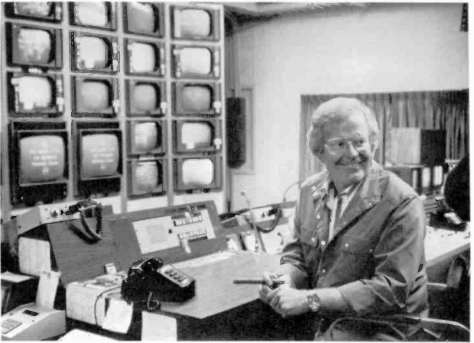
ROONE ARLEDGE: The flamboyant and brilliant executive who directs the destinies of both news and sports at ABC. No other executive has responsibility for so much programing on a single network.