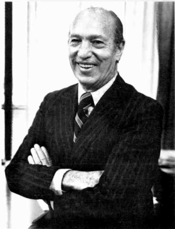
LEONARD H. GOLDENSON, Chairman ABC, Inc.