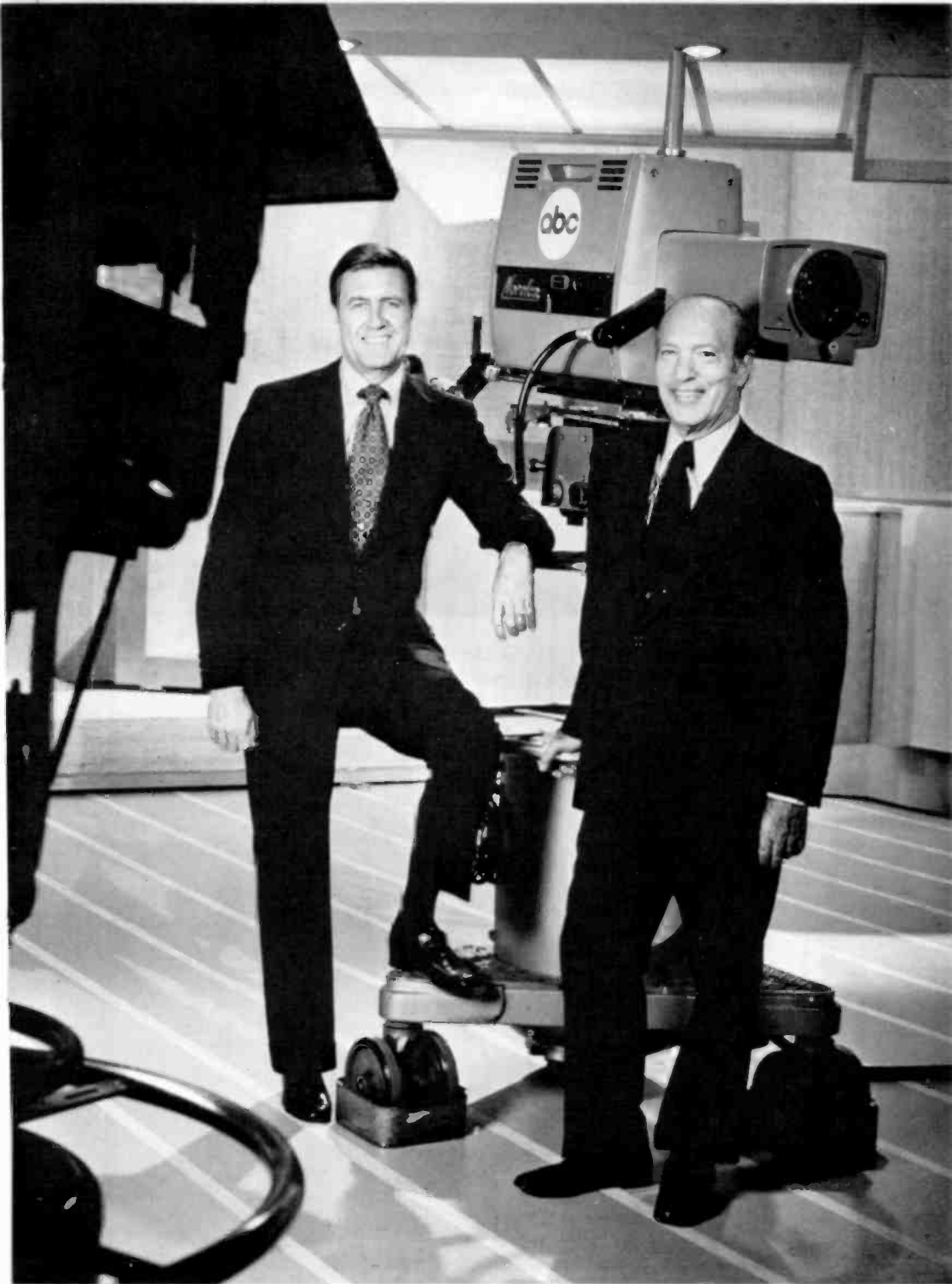
THE WINNING TEAM: Elton Rule, who was appointed President of ABC, Inc. in January of 1972, standing next to Leonard Goldenson, Chairman and Chief Executive Officer. This picture taken in late 1975.