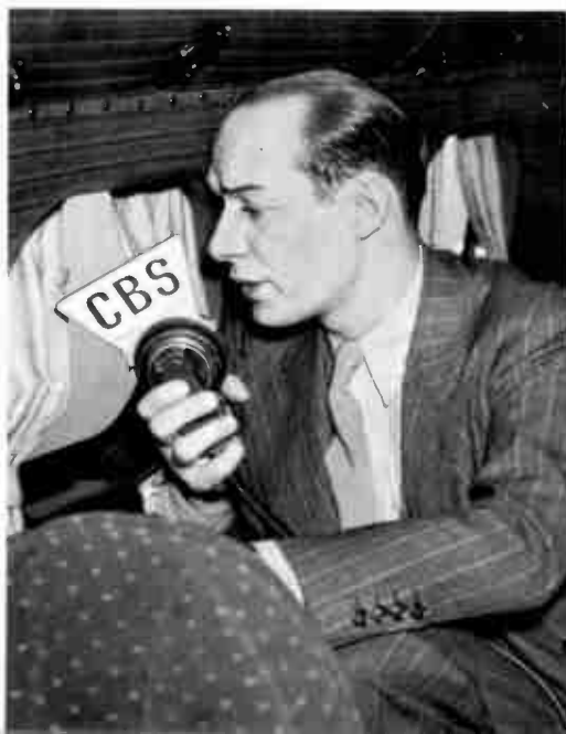
Ted Husing broadcasting from an airplane, viewing the Hindenburg disaster at Lakehurst, New Jersey.