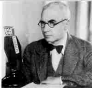
Elmer Davis, considered dean of the news editors, went to Washington to head the Office of War Information. (1942).