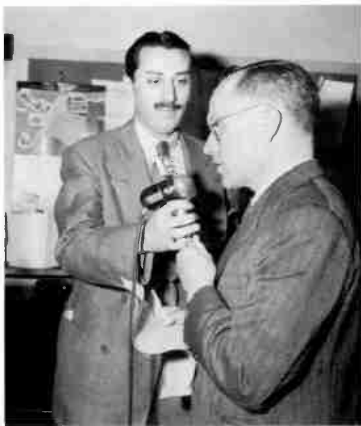
Robert Trout and Quincey Howe broadcast the news of victory in Europe from the CBS newsroom.