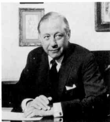
William S. Paley, Chairman of the Board, Columbia Broadcasting System, Inc.