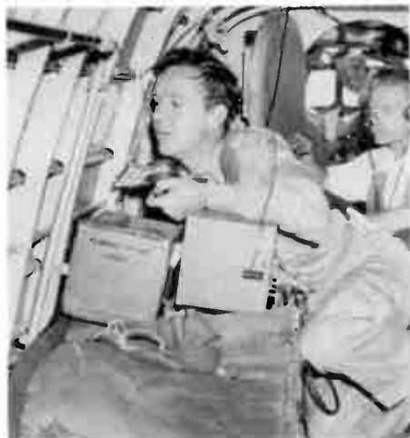
John Daly in an on-the-spot coverage of an air action in World War II.