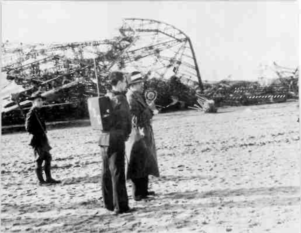
Aftermath of the Hindenburg Zeppelin tragedy, May 1937.