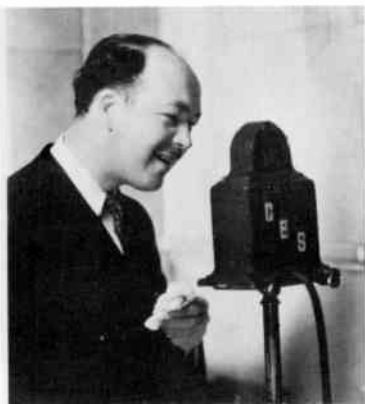
Norman Brokenshire at an old-type microphone in the late 1920s.