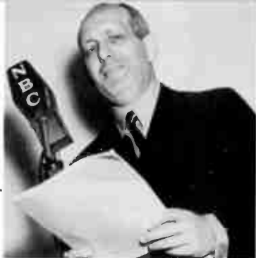
Gabriel Heatter, whose "Ah, there's good news tonight," captured the largest listening audiences in the U.S. during World War II.