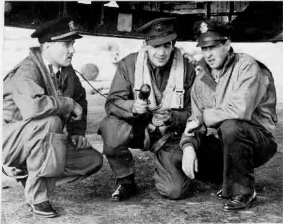
S photo Edward R. Murrow (center) in an on-the-spot broadcast from England during World War II.