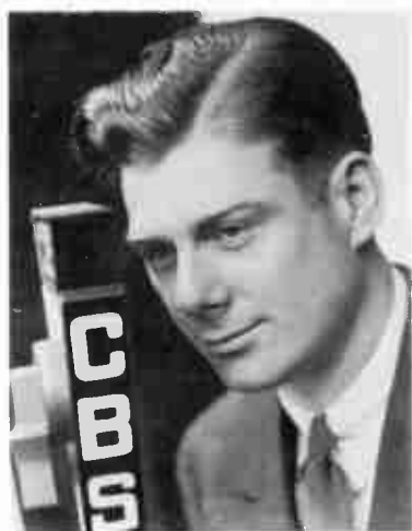
Arthur Godfrey, whose broadcast of the funeral of President Roosevelt, brought tears to the eyes of the nation (April 1945).