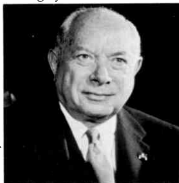
Brig. General David Sarnoff, Chairman of the Board, Radio Corporation of America.