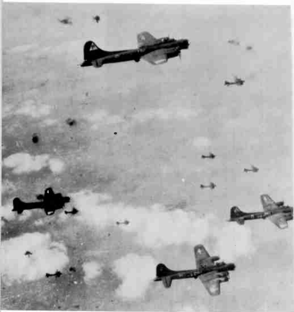
In 1943 Edward R. Murrow was in one of the Allied bombing planes that smashed at Berlin.