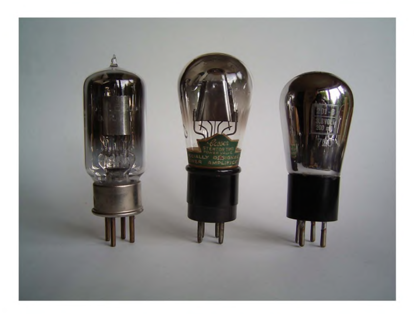
Fig. 7: Output Tubes with Thoriated Tungsten Filament

From the left: Telefunken "RE 209", Cossor "Stentor two", Valvo "201B"