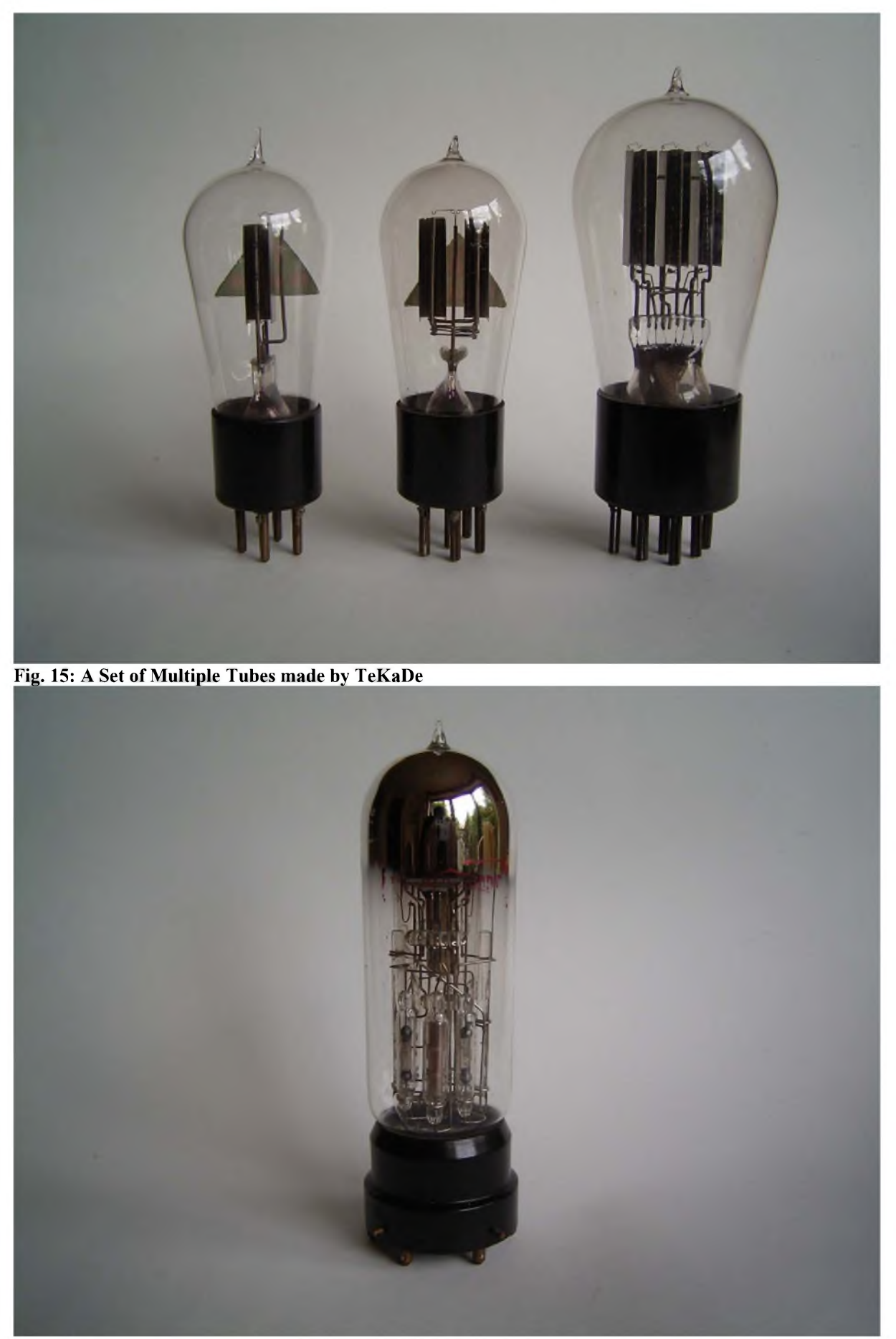
Fig. 16: Multiple Tube 3NF Made by Loewe, containing three tube systems, condensers and resistors