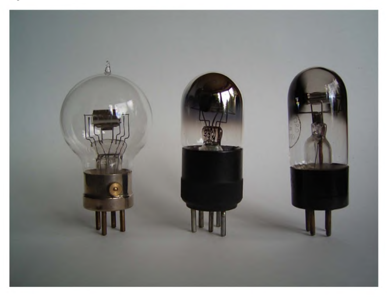
Fig. 13: Space Charge Grid Tubes

Space-charge grid tubes were built with any type of filament and even with indirectly heated cathode. Fig. 143shows a set of these tubes.