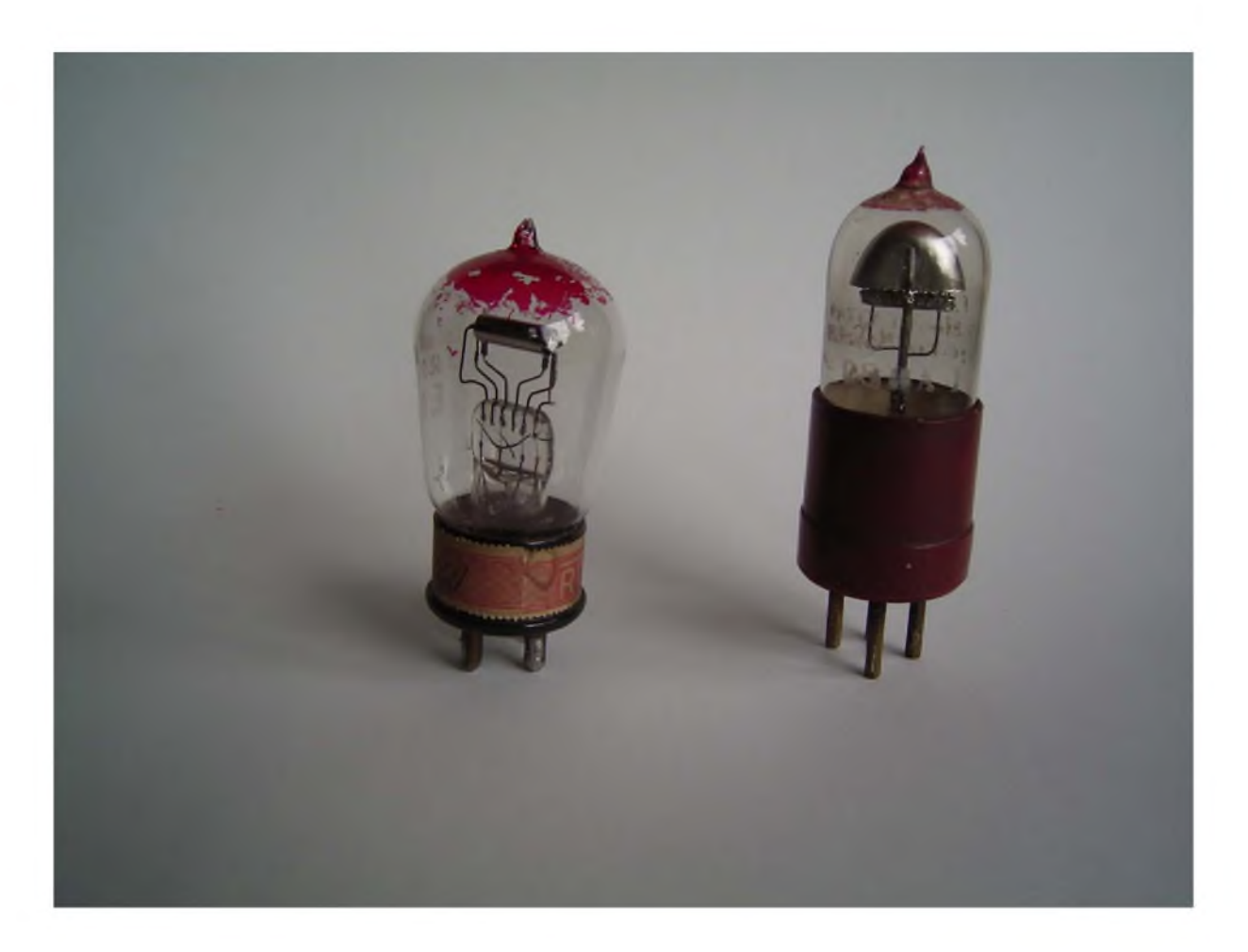
Fig. 4: Selected Tubes with Colour Markings

At first tubes suited for a special application were selected from a whole batch by measurement and then marked by colour. Fig. 4 shows an R.E.84 by Telefunken, marked with red colour (which meant best suited for detector application) and a Cossor P2, marked with red colour too (which meant best suited for high frequency stages [3])