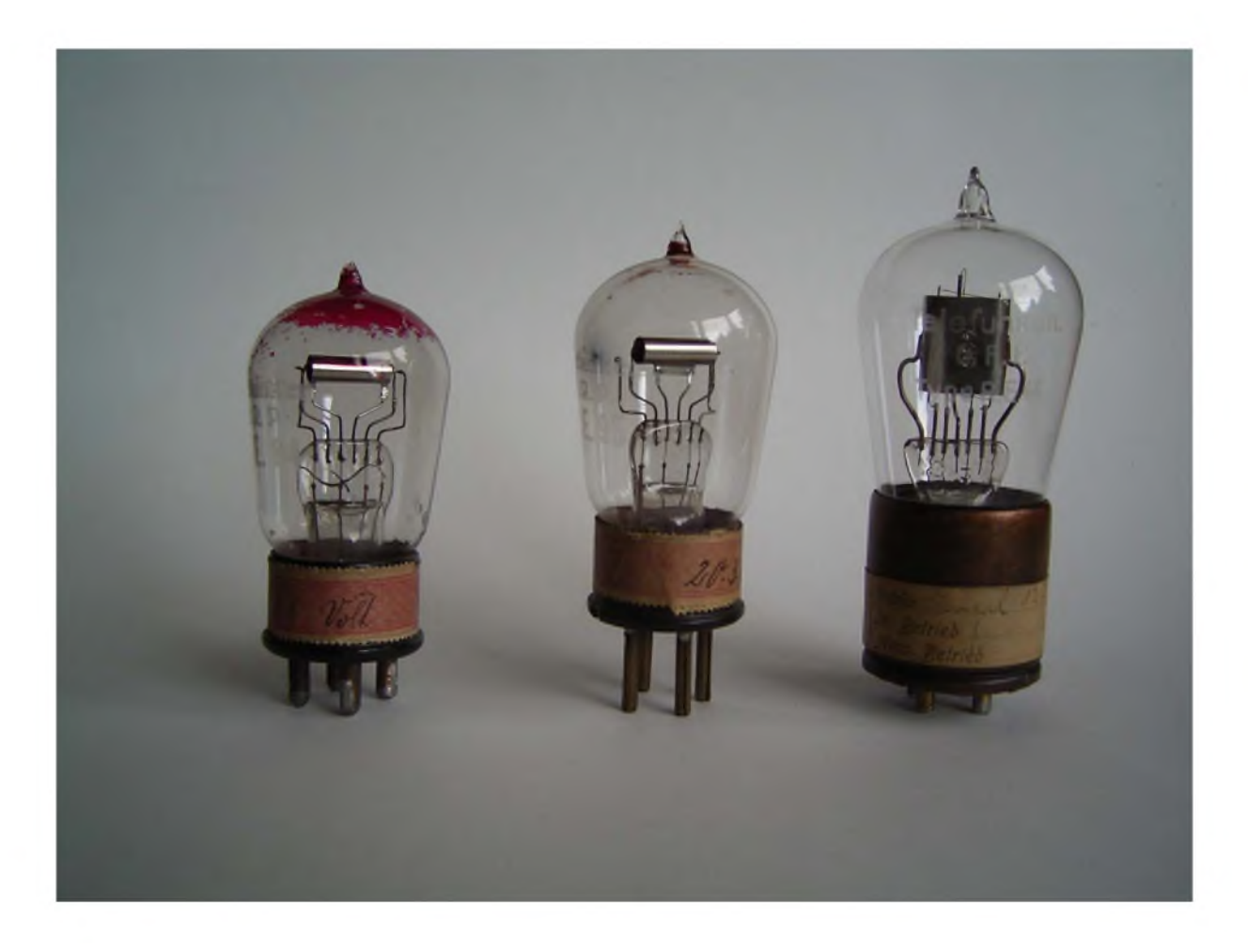
Fig. 14: Tubes with Different Bases

From left to right: R.E.84 (Telefunken base), R.E.95 (British-french base), R.E.48 (UV-base)