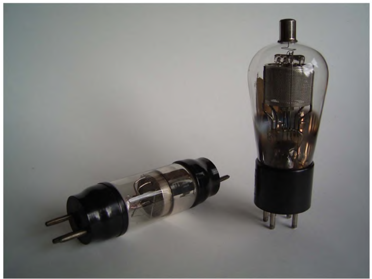
Fig. 8 Screened Valves ("Tetrodes") Left: Marconi-Osram S 625 (thoriated tungsten filament), right: RCA_UY224 (indirectly heated cathode)