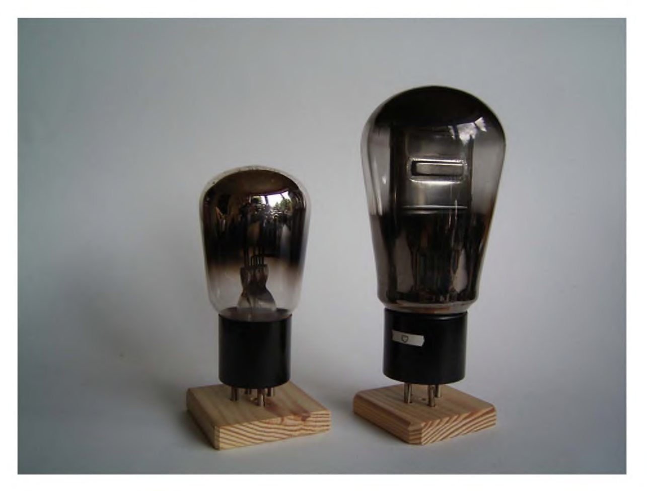
Fig. 10 Dark Emitter Output Tubes

The surplus amount of barium gave a barium deposit inside the glass bulb on the places opposite to the openings of the electrode assembly (Fig.10), acting as the getter. So dark emitter tubes can be recognized by this new getter look.