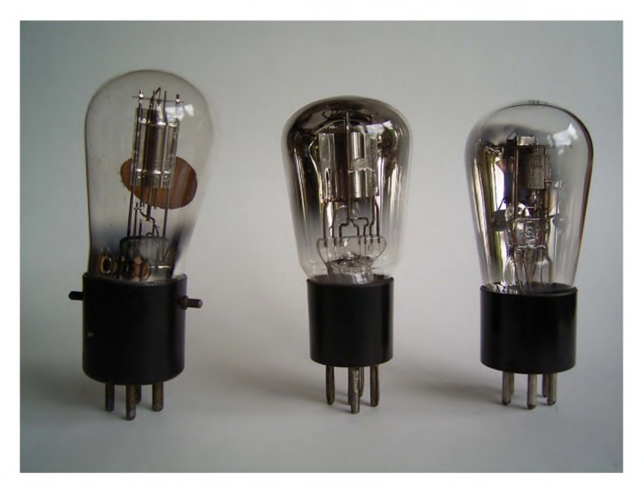
Fig. 12: Indirectly Heated Tubes for Mains Operation

These tubes were introduced in 1927, too.