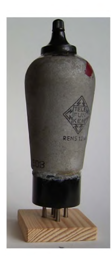
Fig. 9 Tube with electrostatic shielding by Conductive Metal Paint

Fig. 8 Screened Valves ("Tetrodes") Left: Marconi-Osram S 625 (thoriated tungsten filament), right: RCA_UY224 (indirectly heated cathode)