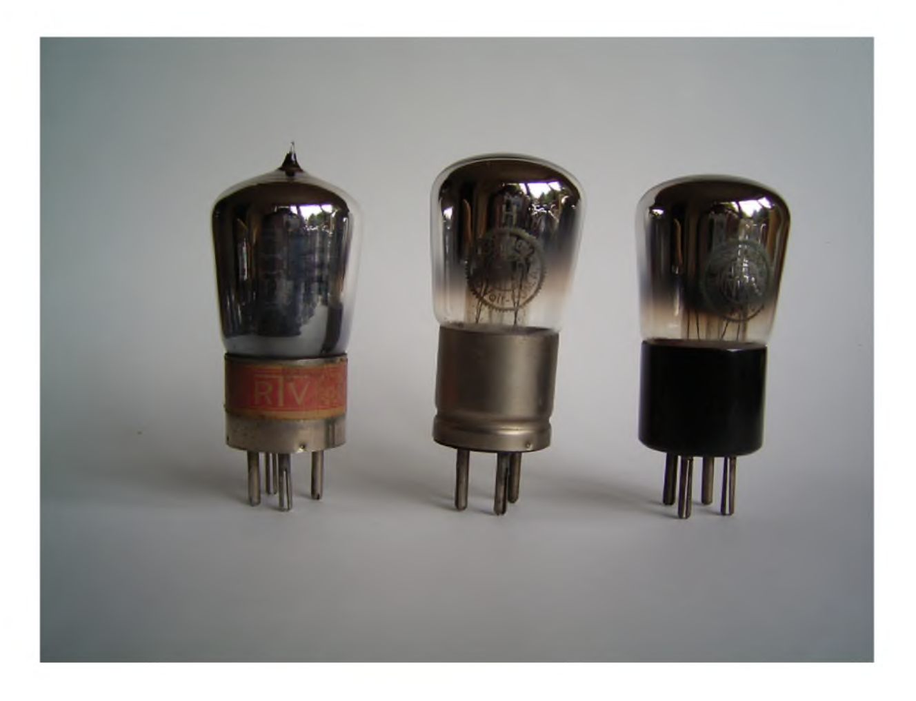
Fig. 5 Specializing of Tubes According to Circuit Demands

(Comparable types were e.g. the "UV 201" by Radio Corporation of America, the D II by Philips, the R5 by Societe Francaise Radioelectrique or the A.R. by Ediswan)