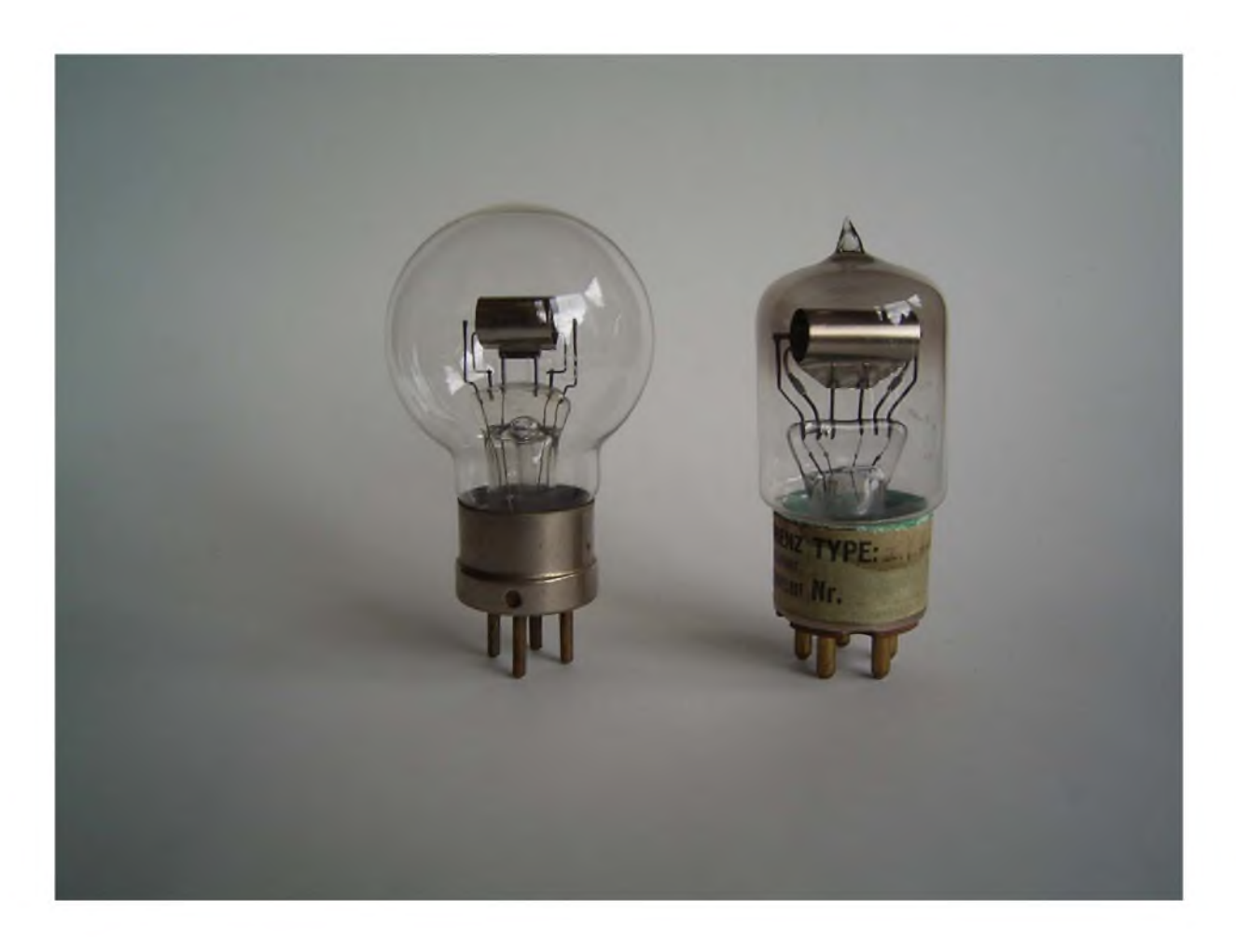
Fig. 6: Early Output Tubes with Tungsten Filament

Even in the early times – that is, in the time of tungsten filament – we find output tubes. Fig. 6 gives two examples.