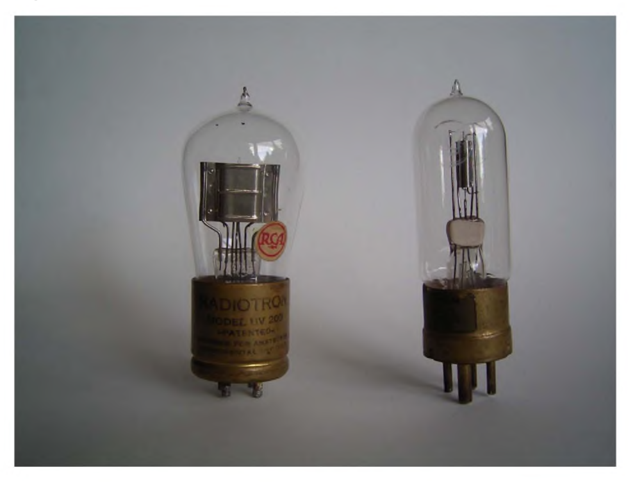
Fig. 2: Examples of the Beginning of the Radio Era Tubes

The radio era started -e.g. in the US in about 1921, in Germany in 1923 - with tubes for general application according to the state of the art, which means they had either pure tungsten or oxide coated filaments and a system either tubular or more plane. This results in basically four types. Fig. 2 shows examples of the Radio Corporation of America