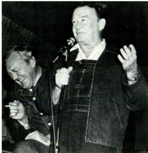
Forrest Tucker always enjoys my "dirty" jokes.