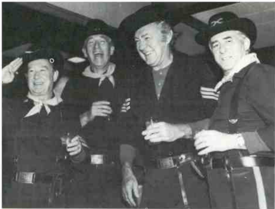
Fun at Lakeside. We honored Forrest Tucker this night for his "F-Troop" series, by drinking all the booze before he arrived.