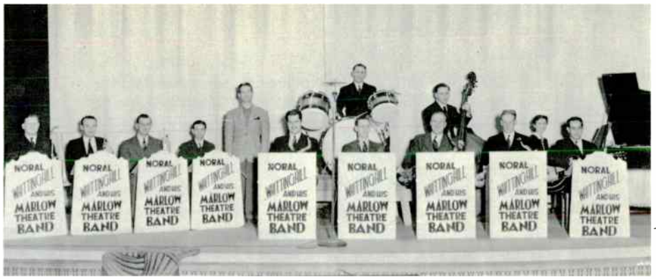
My first band in Montana. What else does one do in winter?