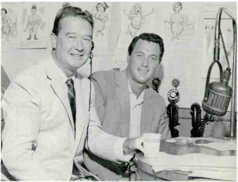
Two of Hollywood's biggest lovers meet to discuss women? (Whit and Rock Hudson) (Below) Giving drinking prerequisites to Jack Lemmon before he joins the charitable Viking organization.