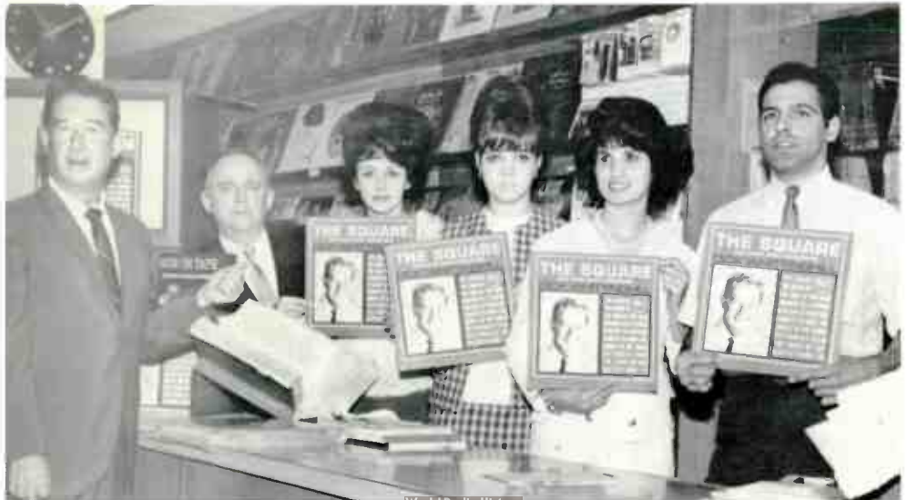
Being a red-blooded true American square, I had to promote my first and only album—"The Square."