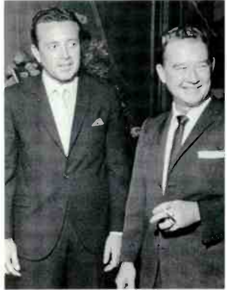
They asked if they could bring along a nice Italian boy singer. I thought it was Sinatra! (Vic Damone)