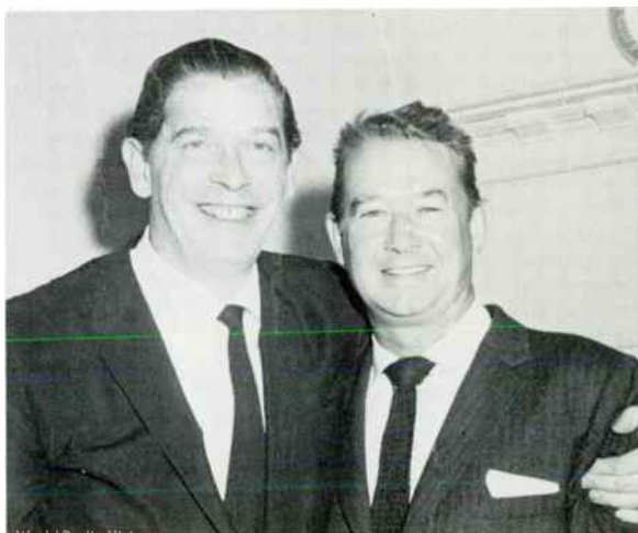
"... he wouldn't have the nerve to steal my jokes." (Milton Berle)