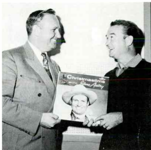
My favorite employer for 25 years, Gene Autry.