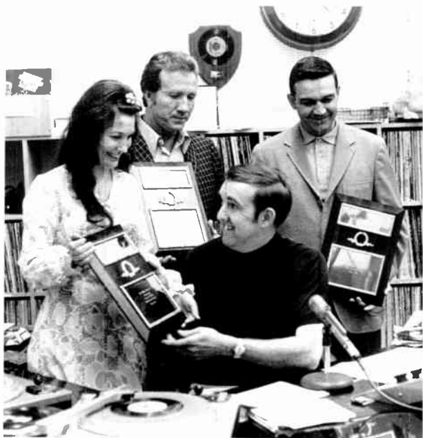
Loretta Lynn and Marty Robbins exhibit plaques commemorating them as the most popular singers on Ralph Emery's all-night show on WSM, May 19, 1969.