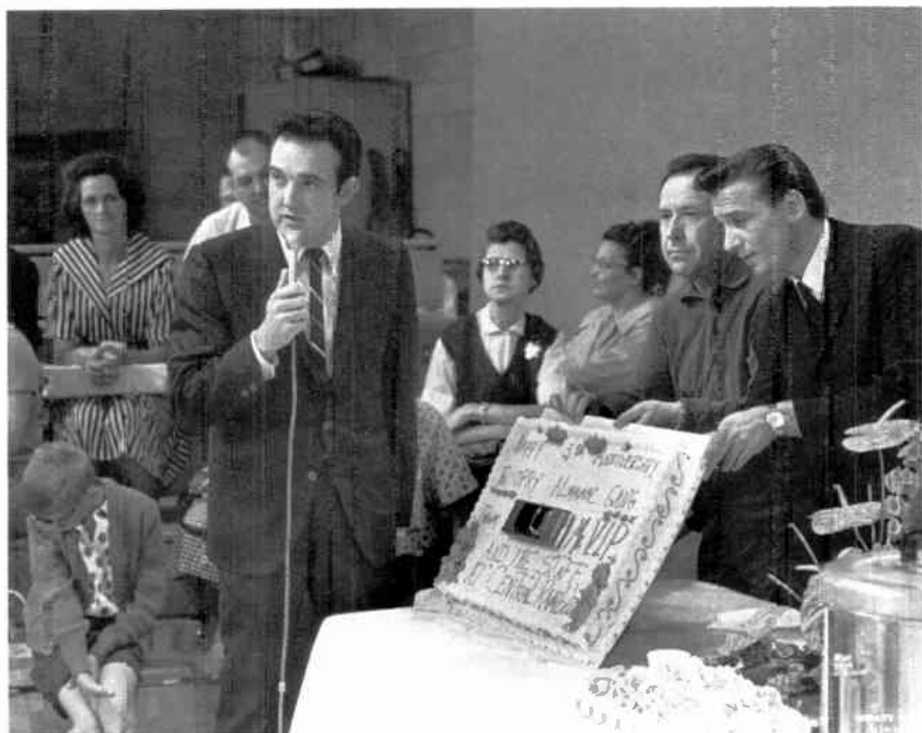
The Morning Show. Waylon Jennings, far right, presents a cake to Ralph on the third anniversary of Emery's local television show, 1966.