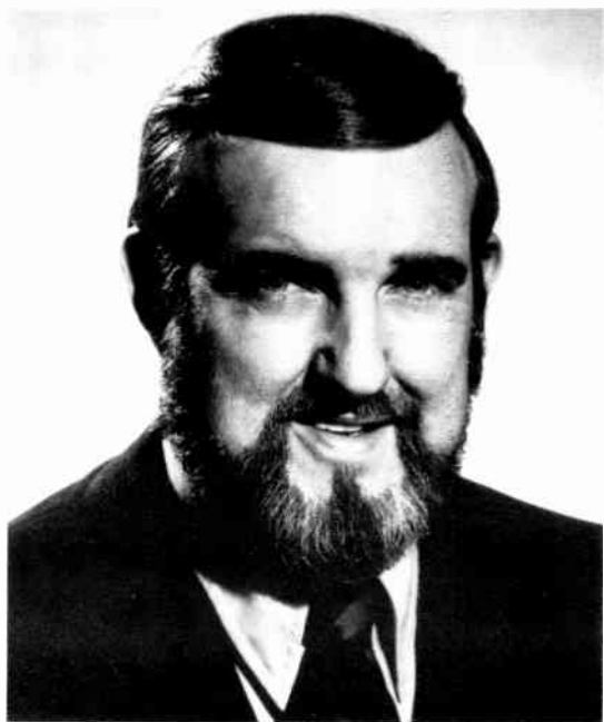
A WSM publicity shot taken after Ralph returned to the station after a brief stint elsewhere, 1974.