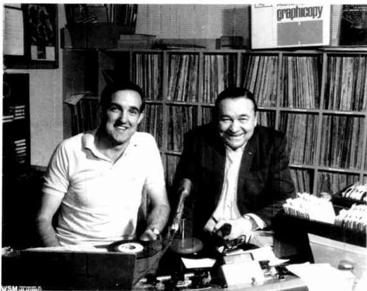
Ralph and Tex Ritter on WSM's all-night show, March 14, 1967.