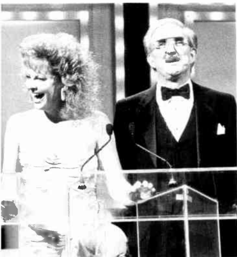
Ralph and Reba McEntire at the "Music City News" awards show in 1988 in Nashville.