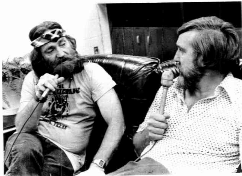
Ralph Emery ( dancing, at left ) and Willie Nelson in a television studio in 1965; above : slightly older (and probably no wiser) on an all-night radio show in 1976.