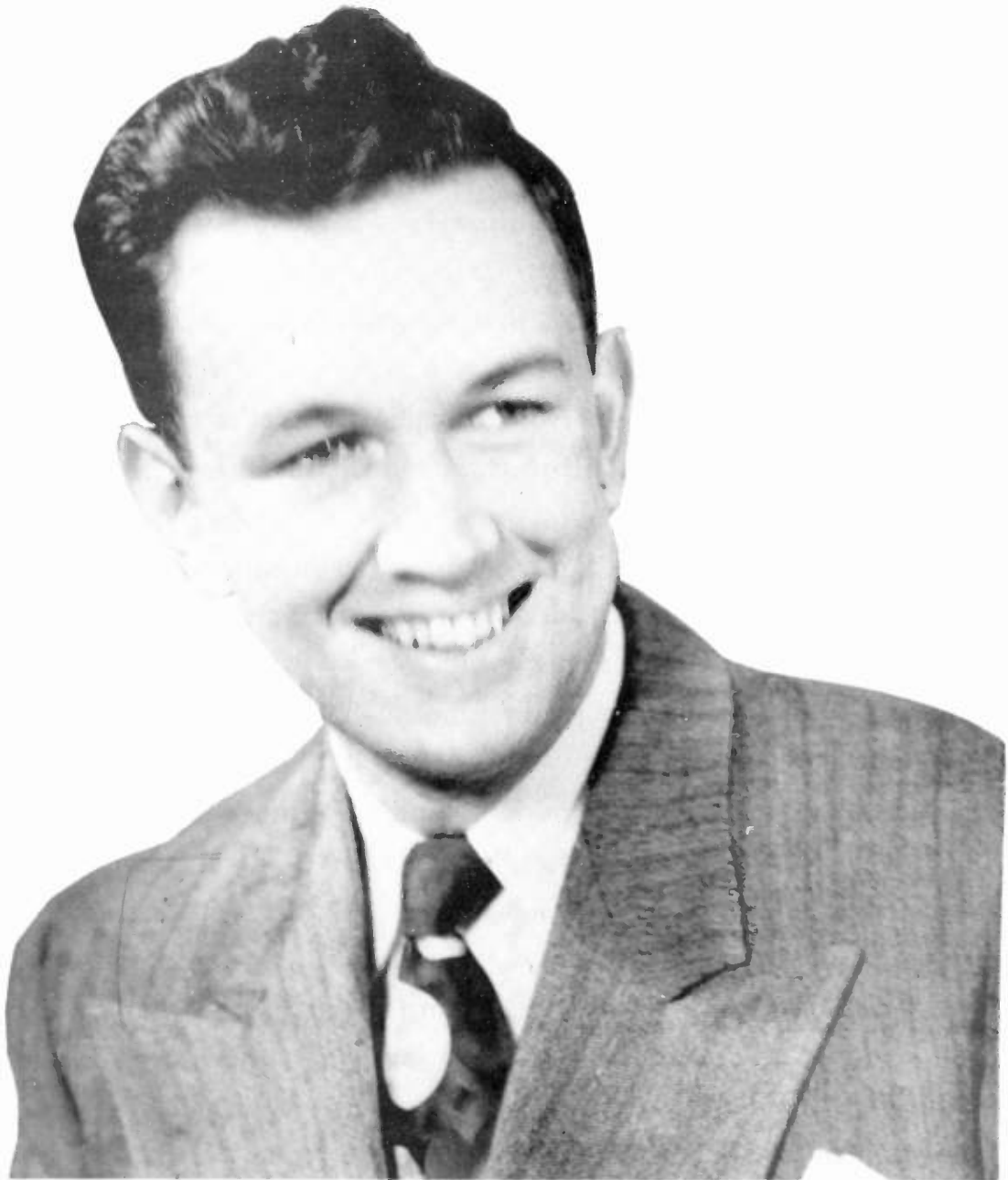
1950 and 1951 in Douglas Georgia Announcer with hair and teeth