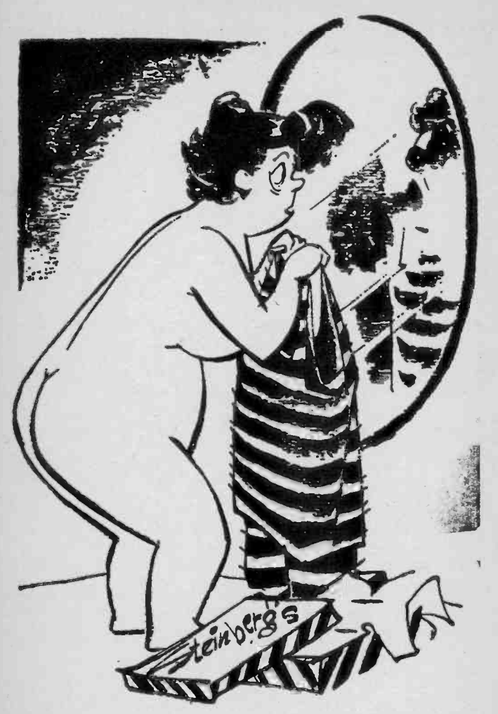
Announces: "Steinberg's Department Store has just received a shipment of large size bathing suits. Ladies, now you can buy a bathing suit for a ridiculous figure."