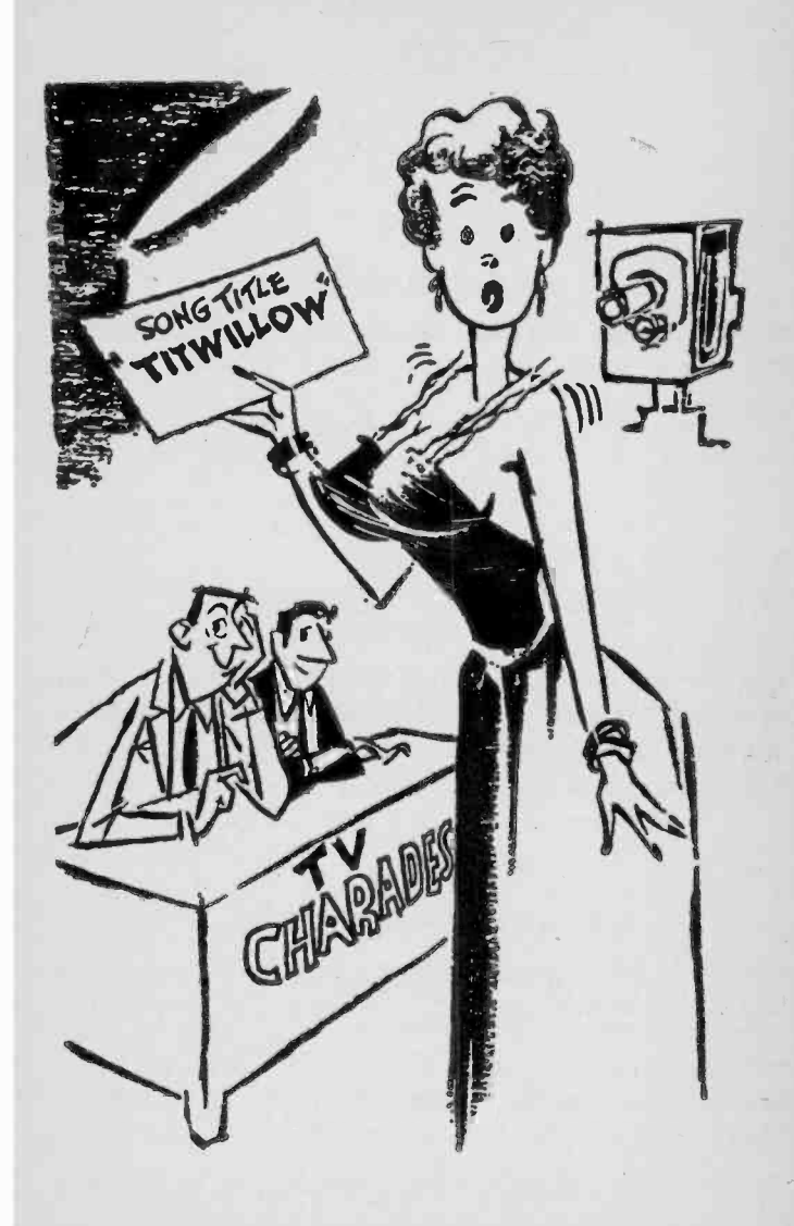
Act It Out!