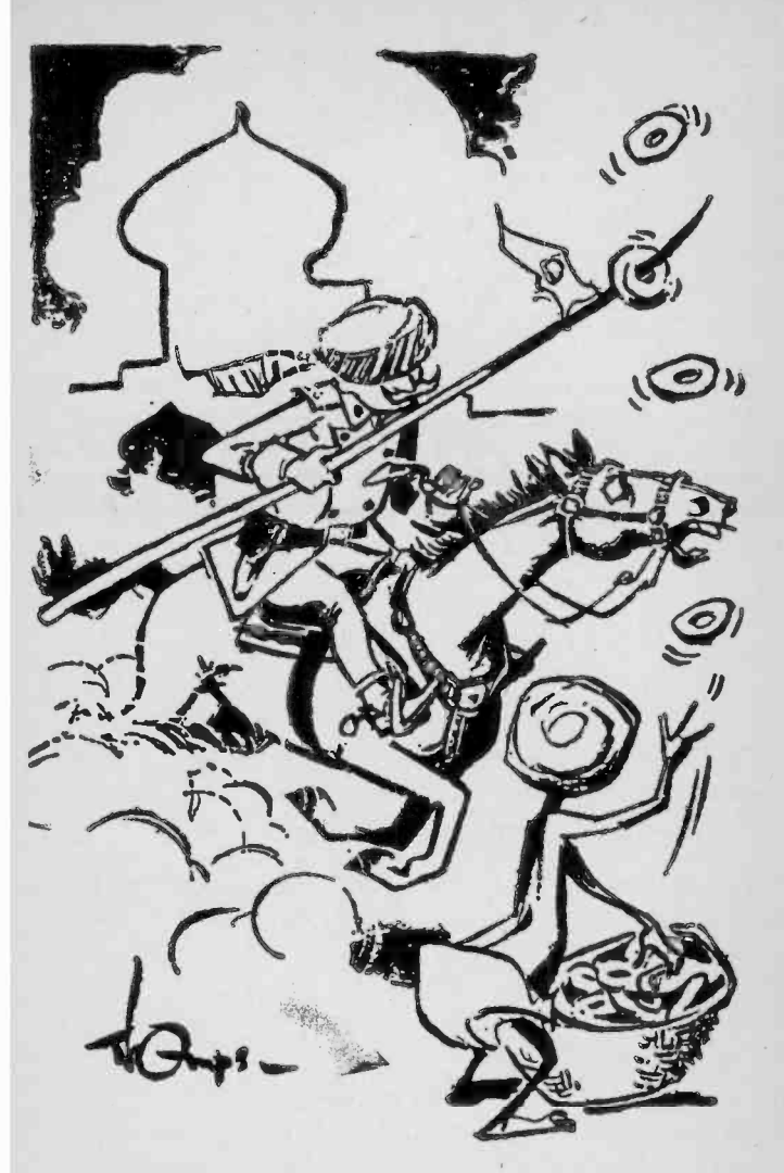
Announcer: "This evening, at eleven PM, the Night Owl TV Theatre will present an action-packed tale of adventure starring Gary Cooper in the "Lives of the Bagel Lancers."