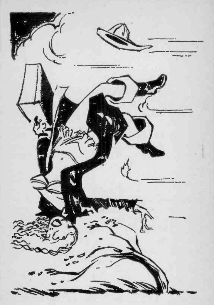
Weather reporter: "... and from the airport's weather bureau we learned that a southeast girl with a wind velocity of seventy miles per hour is reported on her way."