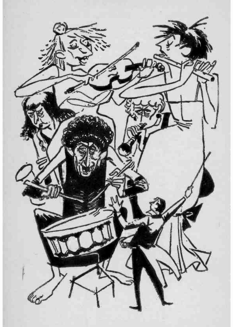
"Stay tuned for Phil Spitoonly and his all-ghoul orchestra."