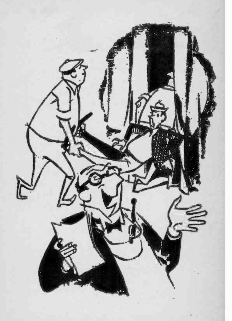
Announcer: "Stay tuned in ten seconds when NBC prevents Pinky Lee!"