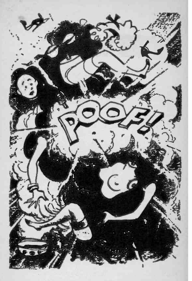
An announcer on a newscast told of this incident: "Word has just reached us that a home-made blonde exploded in the Roxy Theatre this morning."