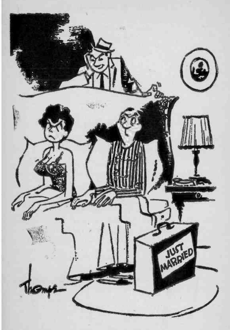
Announcer: "Folks, try our comfortable beds. I personally stand behind every bed we sell."