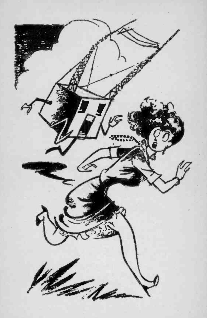
Announces: "This is Indiana's first broad-chasing station."