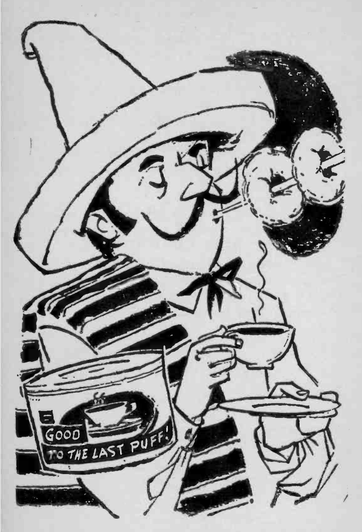
A commercial TV announcer pulled this classic Blooper: "This tasty coffee is made from the finest South American tobaccos."