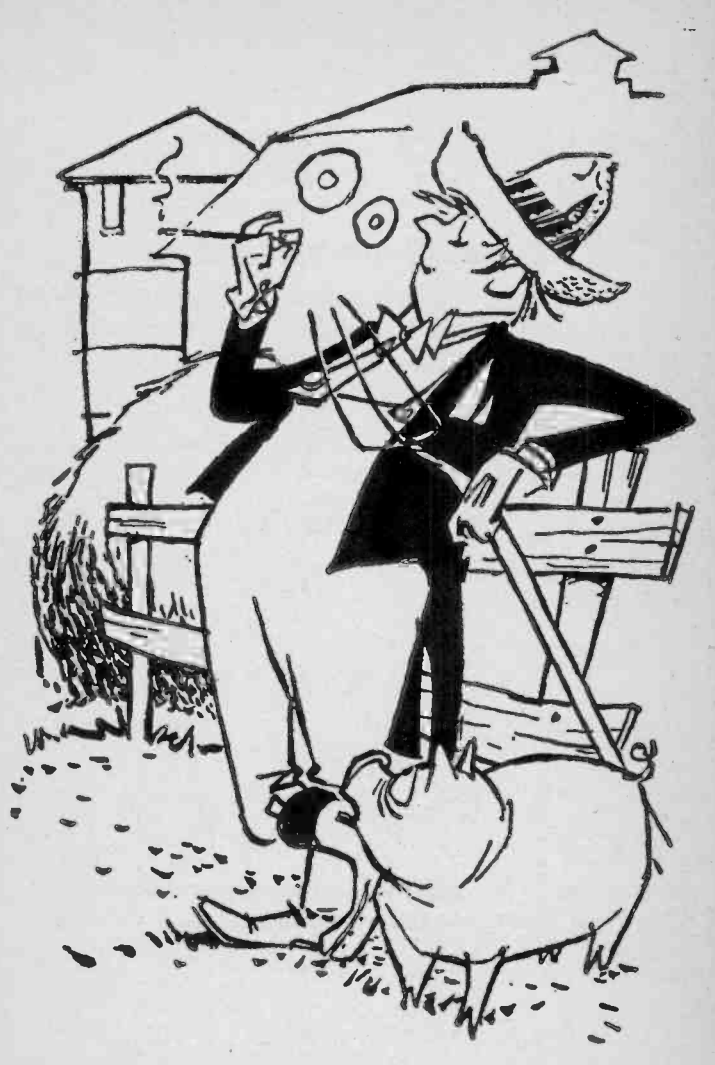
(Commercial for Bernard Men's Clothing Store) "You will always find the best dressed men at Barnyards."