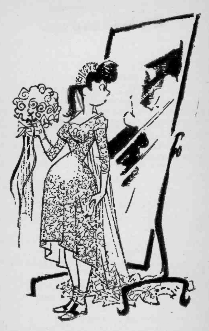
"Hollendale's is open until nine, and don't forget that Hollendale's has the latest maternity fashions for the modern Miss."