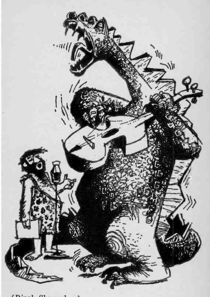
(Dinah Shore show) "Good evening, ladies and gentlemen, it's time for songs—so welcome to the Dinasaur Show!"