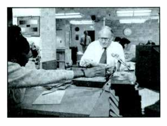
An assistant director cues a news anchor during a live update.

The position of news director is generally the high point of a long career in broadcast journalism. News directors almost always