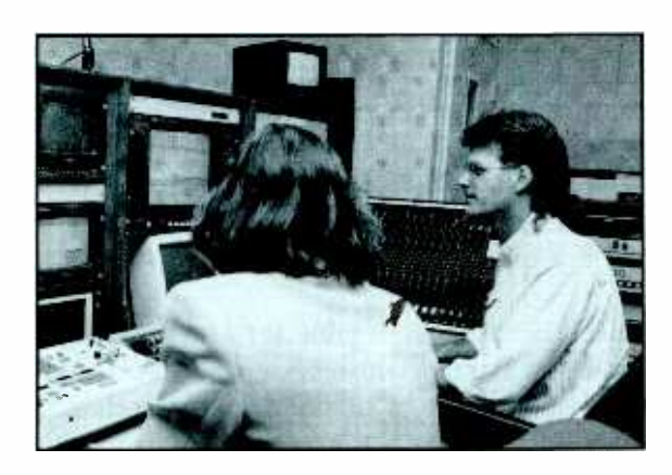
Working with an assistant director, a program editor pieces together a local show to be aired at a later time

The planning and production of local programs broadcast by a television station takes place in the programming department. This department also determines which shows produced independently will be acquired by the station. If the station is affiliated with a network (ABC, CBS, NBC or FOX) or the public television network (PBS), the programming department is the station's liaison with the network. If the station is owned by a large broadcast group, the programming departments of the group stations often work together to develop shows for that group or for sale elsewhere.