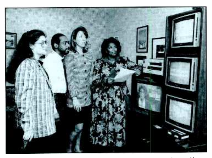
Program directors screen many shows before making up the weekly, monthly or quarterly schedule.

The PRODUCTION ASSISTANT role may have been the gateway to a television career for more top local and national broadcasters and production executives than any other position in a station. This is the ideal entry-level position for anyone interested in a career in almost any aspect of television. This job essentially amounts to an apprenticeship in television.