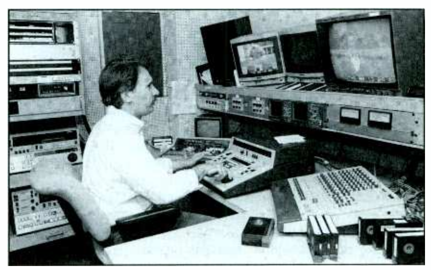
In some stations, producers double as editors and are responsible for the look of a piece. An editor must combine the tape and audio into a complete report.

One of the key elements in defining a station's personality for its viewers is the news operation. The delivery of accurate, timely and well-presented news is seen by many station managers as the primary service that the station can provide for the community.