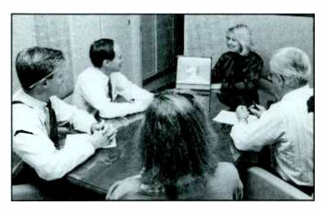
Giving presentations to potential clients is just one part of an account executive's duties.

A television station is above all else, a business ... and an expensive business to maintain. Most of the money to support a station comes from advertising revenue.