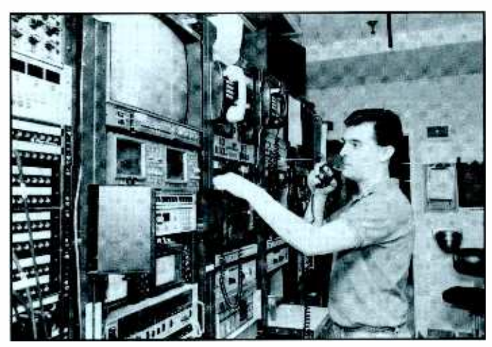
Taking in feeds from various sources is part of the duties of an Electronic News Gathering (ENG) crew.

opportunity to create a visually appealing and journalistically sound product limited only by his or her imagination and creativity.