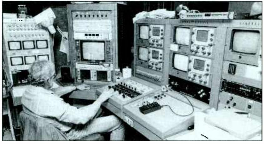
Master Control is where all broadcast signals are routed before they are sent to the transmitter and equipment is monitored for any potential problems that would cause the station to go off the air.

As technology increases, there is a growing trend for technical personnel to be trained and skilled in a variety of engineering functions because they are so closely interrelated in broadcasting.