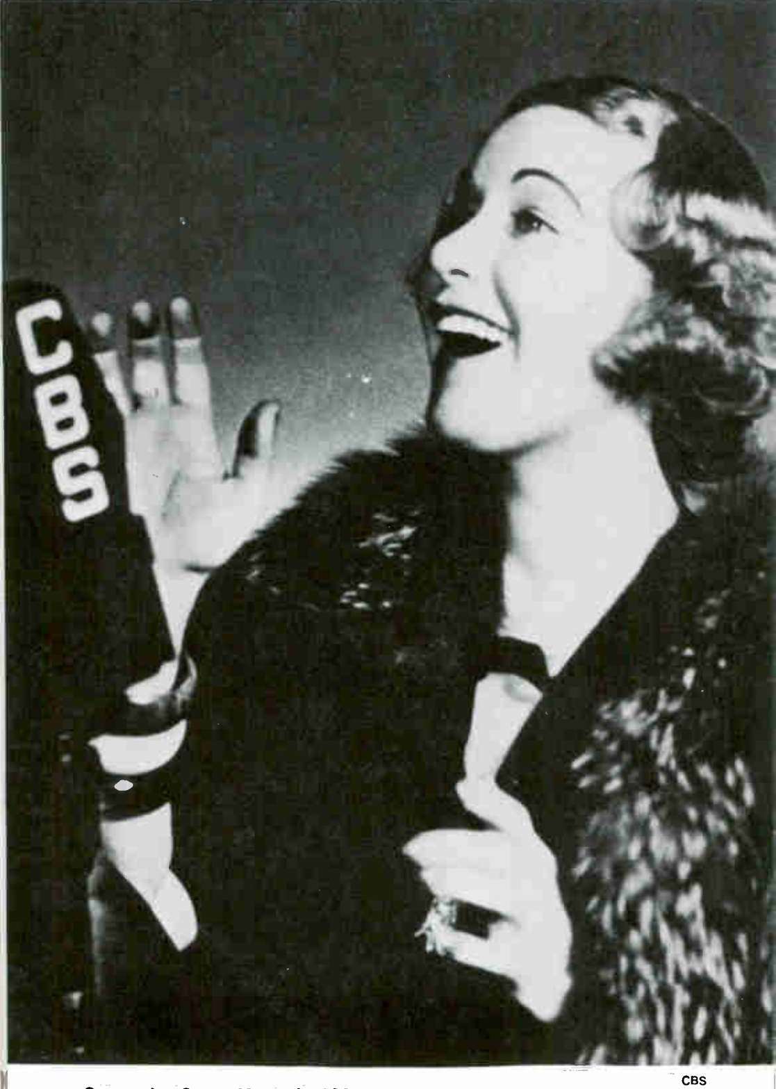
Opera star Grace Moore in 1937.