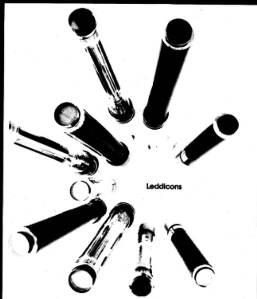
* Registered Trademark of EEV Lead Oxide Camera Tubes.

Power tetrodes... a complete power range is available for TV, AM and FM transmitters.