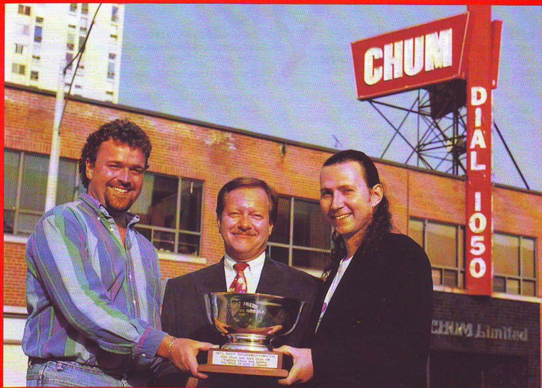
CHUM TORONTO DOCUMENTARY WINS NEW YORK GRAND AWARD TROPHY